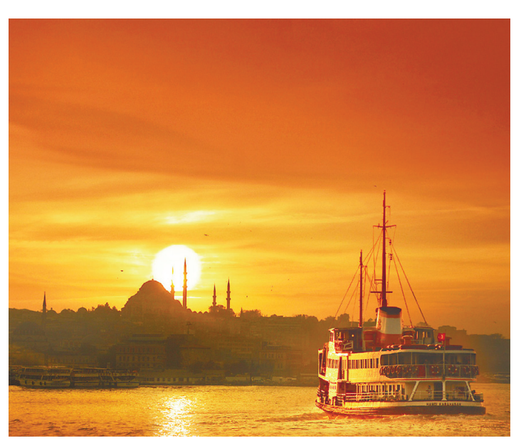
Sunset over Istanbul, the "City of Seven Hills"

I avail myself of this opportunity to reiterate my commitment to contribute to further strengthening the friendly re-