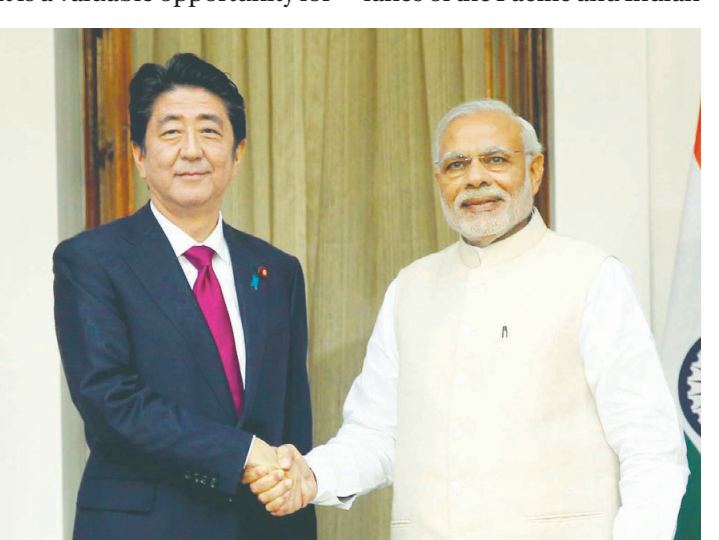
India's Prime Minister Narendra Modi (right) shakes hands with Prime Minister Shinzo Abe in New Delhi in December 2015.

cusp of a new phase in their Together, we can play a sigpartnership and I am confident nificant role in charting the futhat ties between India and ture of the Indo-Pacific region. Japan will prove to be a defining Together, we can promote relationship of the 21st century.