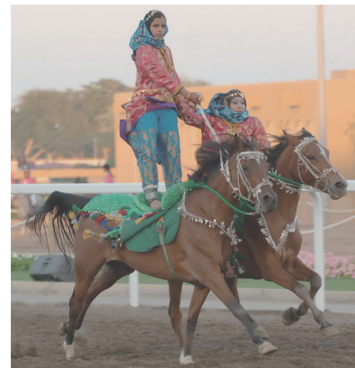
The annual Royal Horse Race Festival displays the sultanate's rich cultural legacy.

On closing, I would like to express my heartfelt appreciation and gratitude to the people of Japan for their kindness and hospitality and to our many friends in Japan for their support and assistance in promoting good relations between our two friendly peoples. I am also indebted to our sponsors, whose generosity has made this supplement possible. I am confident that our relations in the coming days will see the further enhancement of close bonds of friendship between Oman and Japan.