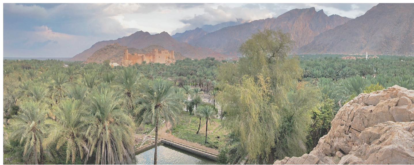
View of Nakhal Fort and surrounding palm plantations in the northwest region of Oman EMBASSY OF OMAN

Congratulations to the People of the Sultanate of Oman on the Occasion of the 46th Anniversary of Their National Day