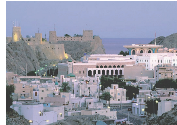
The old city of Muscat EMBASSY OF OMAN

Finance is also an area of potential importance, as Japanese investment and financing in Omani projects continue to expand and provide mutual benefits. To create a more conducive environment for such activities, the Japan-Oman