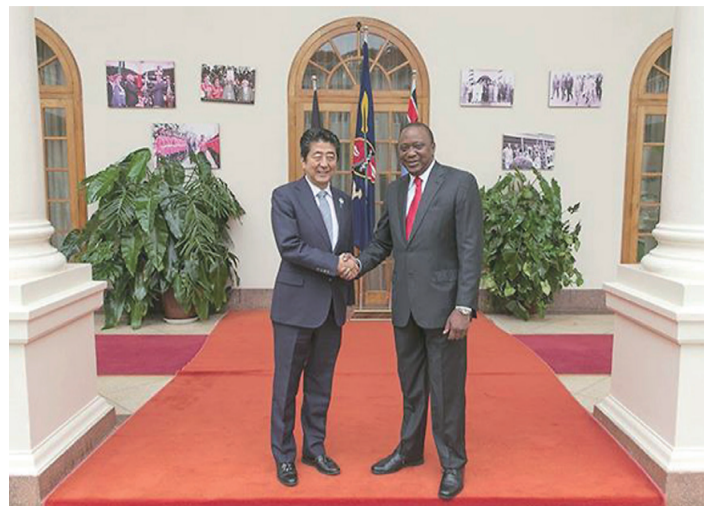
H.E. Prime Minister Shinzo Abe (left) shakes hands with H.E. President of the Republic of Kenya Uhuru Kenyatta at the Nairobi State House during his state visit on Aug. 28.

Our strengthened strategic partnership and cooperation is evidenced by heightened engagement between both countries in support of the realization of Kenya's Vision 2030. This is the economic blueprint that envisages transforming Kenya into a newly industrialized middle-income nation where our citizens will enjoy the highest quality of life by the year 2030. Kenya has prioritized its engagement with Japan, with special emphasis and focus on regional infrastructure, manufacturing sector expansion, capacity development, support for joint ventures for small and medi-