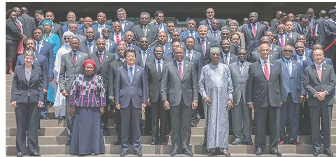
H.E. President Uhuru Kenyatta (front row, center) poses with H.E. Prime Minister Shinzo Abe (front row, third from left) and African Heads of State and Government during the sixth Tokyo International Conference on African Development (TICAD VI) at the Kenyatta International Convention Centre on Aug. 27.

It is worthwhile mentioning that out of the MOUs signed, 20 involved Kenya. Indeed, TICAD VI was a defining moment for the TICAD process. The formalization of the pri-