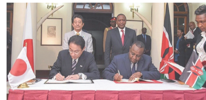
Foreign Minister Fumio Kishida (left) and Kenya's Finance Minister Henry Rotich sign the Agreement on Promotion and Protection of Investment on Aug. 28.

Additionally, Nairobi has successfully hosted high profile conferences. Key among these are the UNEA II conference in May 2015, the AU Ministerial Retreat in May, the Global Entrepreneurship Summit in July 2015, the World Trade Organization 10th Ministerial Conference in Decem-