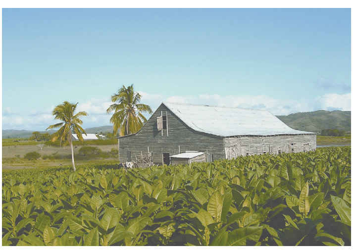
Top: Havana Cathedral in the center of Old Havana; Above: A curing barn in the city of Pinar del Rio

you the esteem, respect and special consideration of all Cubans and its government, for the consistent and renewed expressions of solidarity and friendship with Cuba, received over time, from friendship organizations, members of parliament, political parties and Japanese society in general. The friendship and solidarity with our country in Japan constitutes a fundamental pillar for the development of the bilateral relations in this new stage. We will never forget the deep symbolism embodied in the fact that the very day that the world voted with Cuba at