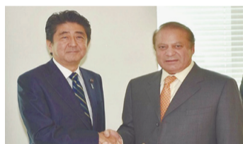
Prime Minister Muhammad Nawaz Sharif and Prime Minister Shinzo Abe at the U.N. General Assembly on Sept. 20.