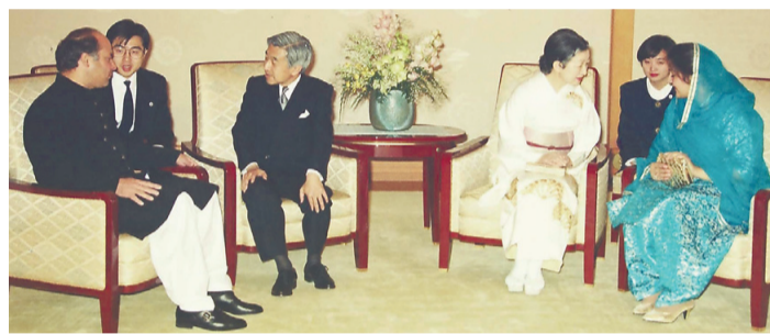
Prime Minister Muhammad Nawaz Sharif, left, and his wife Kalsoom Nawaz Sharif, right, visit Emperor Akihito and Empress Michiko at the Imperial Palace during their visit to Tokyo on Dec. 18, 1992.

Please allow me to express my congratulations to Pakistan once again on the occasion of Pakistan Day. We look forward to further reinforcement of friendships and partnerships that exist between the two countries even in these uncertain times.