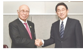
Sartaj Aziz, Advisor to the Prime Minister on Foreign Affairs, and Foreign Minister Fumio Kishida during the U.N. General Assembly on Sept. 20.