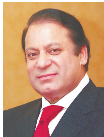
Prime Minister of Pakistan Muhammad Nawaz Sharif

Japan has a great heart as seen in its global development activities. Pakistan has a great heart, too, having given sanctuary to European refugees in the late 1940s and again in the 1990s and then to the millions who came from neighboring countries. Since 1979 we con-