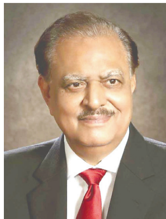
President of Pakistan Mamnoon Hussain

I would like to take this opportunity to extend my best wishes for the continued prosperity of Pakistan and further development of friendly relations between Japan and Pakistan.