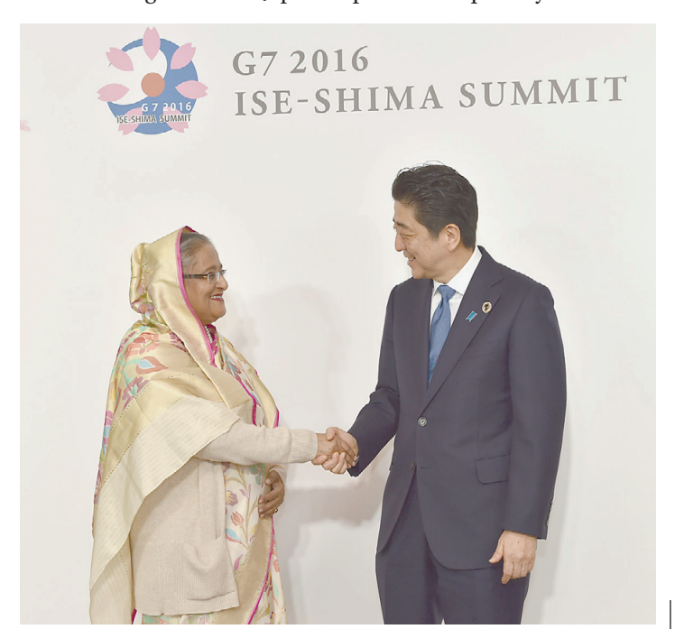
Prime Minister Sheikh Hasina and Prime Minister Shinzo Abe meet at the G-7 Ise-Shima summit outreach program in Mie Prefecture in May.