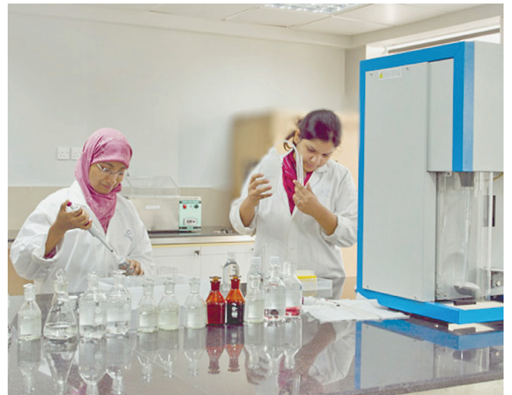
Bangladesh is exporting pharmaceutical products to more than