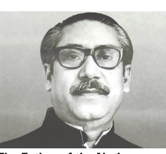
The Father of the Nation Bangabandhu Sheikh Mujibur

proclaimed our country's independence on March 26, 1971, after inspiring the whole nation with Bengalee nationalism and preparing them for independence. Under his charismatic leadership, we achieved our much-awaited independence through a nine-month-long armed struggle. Today, I offer my deep tributes to the martyrs and valiant sons of the soil, who made the supreme sacrifice in the War of Liberation. I also recall with deep reverence our four national leaders, valiant freedom fighters, organizers, supporters and people from all walks of life for their unmatched valor, immense contributions and courageous acts that accelerated the