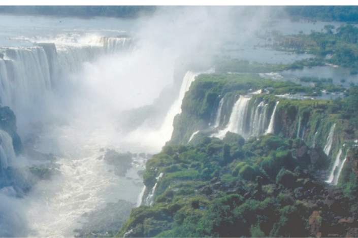
Iguazu Falls in Misiones province. INPROTUR