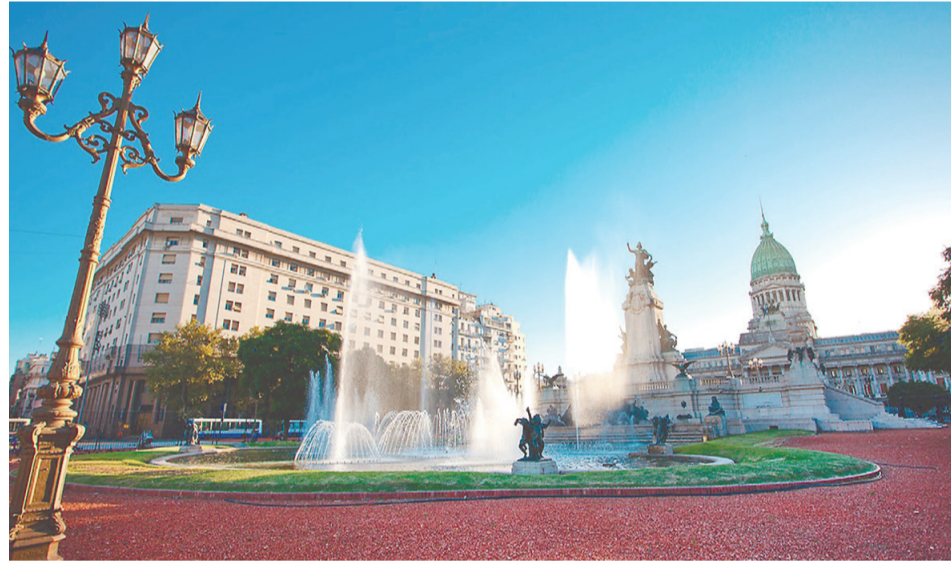
The congress building in Buenos Aires.

Both countries are working closely together every day to strengthen their traditional ties to celebrate their 120th anniversary of diplomatic relations in 2018 at a peak stage of their friendly relationship.