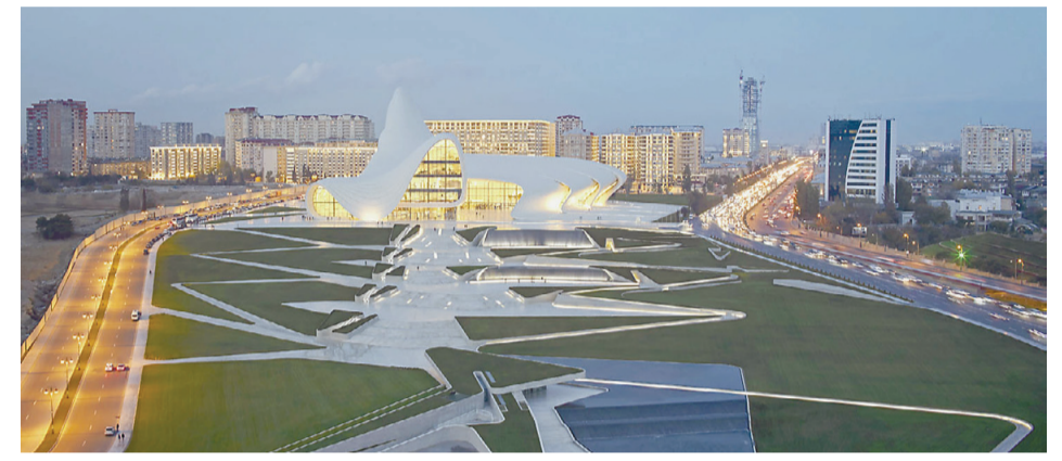
Top: Night view of Baku; Below: Heydar Aliyev Center in the capital EMBASSY OF AZERBAIJAN