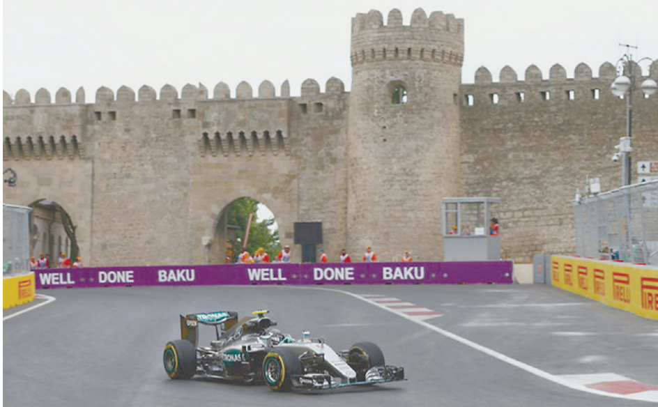
Baku hosted a Formula One race in 2016.

Over the past 25 years we have seen the strong development of our bilateral relations, particularly in the economic sphere, where our trade turnover has increased by almost tenfold in the last 10 years. Along with the giant Japanese companies involved in the leading energy projects in Azerbaijan, nowadays we have medium and small enterprises, as well as joint ventures creating beneficial business both in Azerbaijan and Japan. Consumers can already gain access to Azerbaijani products such as wine, pomegranate juice and honey in Japanese markets.