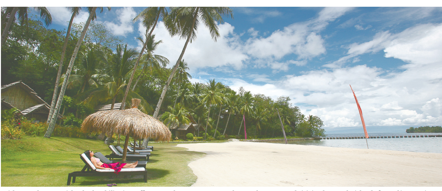
With more than 7,100 islands, the Philippines offers more than 7,100 reasons why travelers come and visit its shores. The island of Samal is an oasis that is the perfect getaway from the bustle of city life. Samal is a 90-minute flight from Manila.