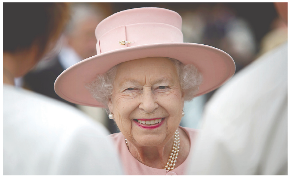
Queen \, Elizabeth \, II \, greets \, guests \, at \, a \, garden \, party \, at \, Buckingham \, Palace \, in \, London \, on \, May \, 16. \, AFP-JIJI \, AFP-JIJI \, AFP-JIJI \, AFP-JIJI \, AFP-JIJI \, AFP-JIJI \, AFP-JIJI \, AFP-JIJI \, AFP-JIJI \, AFP-JIJI \, AFP-JIJI \, AFP-JIJI \, AFP-JIJI \, AFP-JIJI \, AFP-JIJI \, AFP-JIJI \, AFP-JIJI \, AFP-JIJI \, AFP-JIJI \, AFP-JIJI \, AFP-JIJI \, AFP-JIJI \, AFP-JIJI \, AFP-JIJI \, AFP-JIJI \, AFP-JIJI \, AFP-JIJI \, AFP-JIJI \, AFP-JIJI \, AFP-JIJI \, AFP-JIJI \, AFP-JIJI \, AFP-JIJI \, AFP-JIJI \, AFP-JIJI \, AFP-JIJI \, AFP-JIJI \, AFP-JIJI \, AFP-JIJI \, AFP-JIJI \, AFP-JIJI \, AFP-JIJI \, AFP-JIJI \, AFP-JIJI \, AFP-JIJI \, AFP-JIJI \, AFP-JIJI \, AFP-JIJI \, AFP-JIJI \, AFP-JIJI \, AFP-JIJI \, AFP-JIJI \, AFP-JIJI \, AFP-JIJI \, AFP-JIJI \, AFP-JIJI \, AFP-JIJI \, AFP-JIJI \, AFP-JIJI \, AFP-JIJI \, AFP-JIJI \, AFP-JIJI \, AFP-JIJI \, AFP-JIJI \, AFP-JIJI \, AFP-JIJI \, AFP-JIJI \, AFP-JIJI \, AFP-JIJI \, AFP-JIJI \, AFP-JIJI \, AFP-JIJI \, AFP-JIJI \, AFP-JIJI \, AFP-JIJI \, AFP-JIJI \, AFP-JIJI \, AFP-JIJI \, AFP-JIJI \, AFP-JIJI \, AFP-JIJI \, AFP-JIJI \, AFP-JIJI \, AFP-JIJI \, AFP-JIJI \, AFP-JIJI \, AFP-JIJI \, AFP-JIJI \, AFP-JIJI \, AFP-JIJI \, AFP-JIJI \, AFP-JIJI \, AFP-JIJI \, AFP-JIJI \, AFP-JIJI \, AFP-JIJI \, AFP-JIJI \, AFP-JIJI \, AFP-JIJI \, AFP-JIJI \, AFP-JIJI \, AFP-JIJI \, AFP-JIJI \, AFP-JIJI \, AFP-JIJI \, AFP-JIJI \, AFP-JIJI \, AFP-JIJI \, AFP-JIJI \, AFP-JIJI \, AFP-JIJI \, AFP-JIJI \, AFP-JIJI \, AFP-JIJI \, AFP-JIJI \, AFP-JIJI \, AFP-JIJI \, AFP-JIJI \, AFP-JIJI \, AFP-JIJI \, AFP-JIJI \, AFP-JIJI \, AFP-JIJI \, AFP-JIJI \, AFP-JIJI \, AFP-JIJI \, AFP-JIJI \, AFP-JIJI \, AFP-JIJI \, AFP-JIJI \, AFP-JIJI \, AFP-JIJI \, AFP-JIJI \, AFP-JIJI \, AFP-JIJI \, AFP-JIJI \, AFP-JIJI \, AFP-JIJI \, AFP-JIJI \, AFP-JIJI \, AFP-JIJI \, AFP-JIJI \, AFP-JIJI \, AFP-JIJI \, AFP-JIJI \, AFP-JIJI \, AFP-JIJI \, AFP-JIJI \, AFP-JIJI \, AFP-JIJI \, AFP-JIJI \, AFP-JIJI \, AFP-JIJI \, AFP-JIJI \, AFP-JIJI \, AFP-JIJI \, AFP-JIJI \, AFP-JIJI \, AFP-JIJI \, AFP-JIJI \, AFP-JIJI \, AFP-JIJI \, AFP-JIJI \, AFP-JIJI \, AFP-JIJI \, AFP-JIJI \, AFP-JIJI \, AFP-JIJI \, AFP-JIJI \, AFP-JIJI \, AFP-JIJI \, AFP-JIJI \

Earlier this year, Her Majesty's husband and consort, HRH Prince Philip, who turned 96 last week, announced that he would be stepping down from public