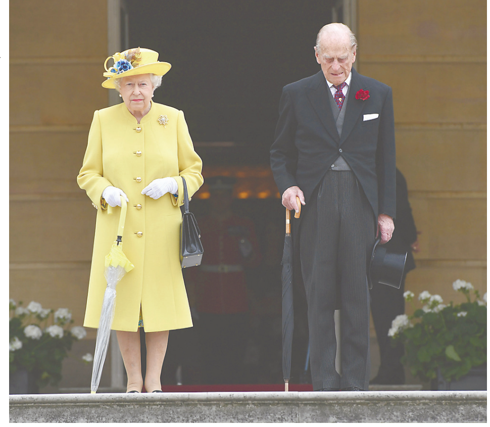
Queen Elizabeth II and Prince Philip observe a minute's silence to honor the victims of the attack on Manchester Arena at the start of a garden party at Buckingham Palace in London on May 23.

Last month I was present when Prime Minister Shinzo Abe met Prime Minister May at Chequers, her country residence. The two leaders discussed a wide range of areas of cooperation, and it was clear that there is a strong commitment to working even more closely together, as two countries that share so many values.