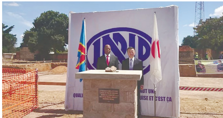
Inauguration of the construction of INPP-Katanga/Lubumbashi EMBASSY OF THE DEMOCRATIC REPUBLIC OF THE CONGO