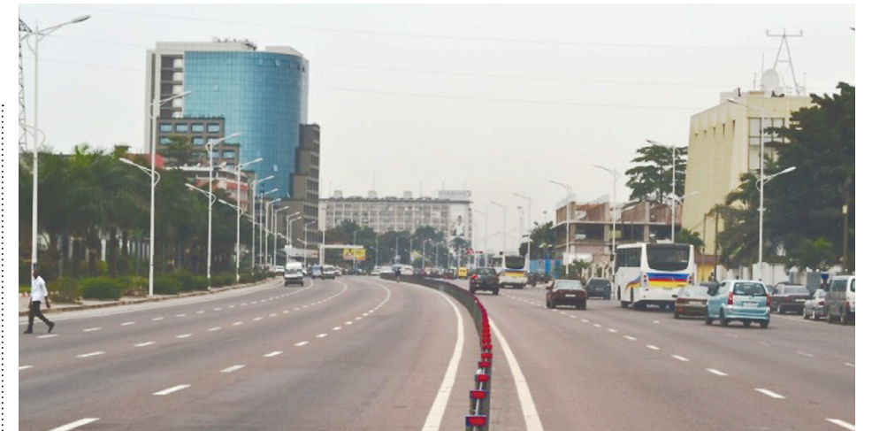
Boulevard du 30 Juin in Kinshasa EMBASSY OF THE DEMOCRATIC REPUBLIC OF THE CONGO

As mentioned above, we would like to see the Japanese private sector join other partners of D.R. Congo to invest in our country. The mining industry, tourism industry and construction of infrastructure in D.R. Congo present good opportunities. In conclusion, I invite the Japanese private sector to invest in D.R. Congo for the continuity of the cooperation and the benefit of our peoples.