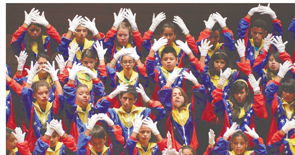
The Ensemble Lara Somos and the White Hand Chorus of Venezuela, part of the Special Education Program of El Sistema, are comprised of people with disabilities. They will visit Japan in October to perform alongside the newly created White Hand Chorus of Tokyo.

This month we commemorate the 25th anniversary of the historic visit to Venezuela by His Imperial Highness Crown Prince Naruhito. As we continue to cherish this historic moment, I would like to express my steadfast commitment to further and deepen the friendly ties between our two countries and peoples.