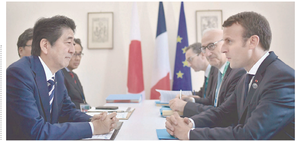
President Emmanuel Macron (right) and Japanese Prime Minister Shinzo Abe hold bilateral talks on the sidelines of the Group of Seven summit in Taormina, Italy, on May 26.

In recent years, the growing numbers of French visiting Japan and Japanese visiting France have also strengthened the bonds that unite our people. France is happy and proud to welcome more Japanese tourists and dedicated to ensure their safe travel. We were also delighted that our wonderful friend Kumamon was named a sightseeing and goodwill ambassador to France to visit France's tourist