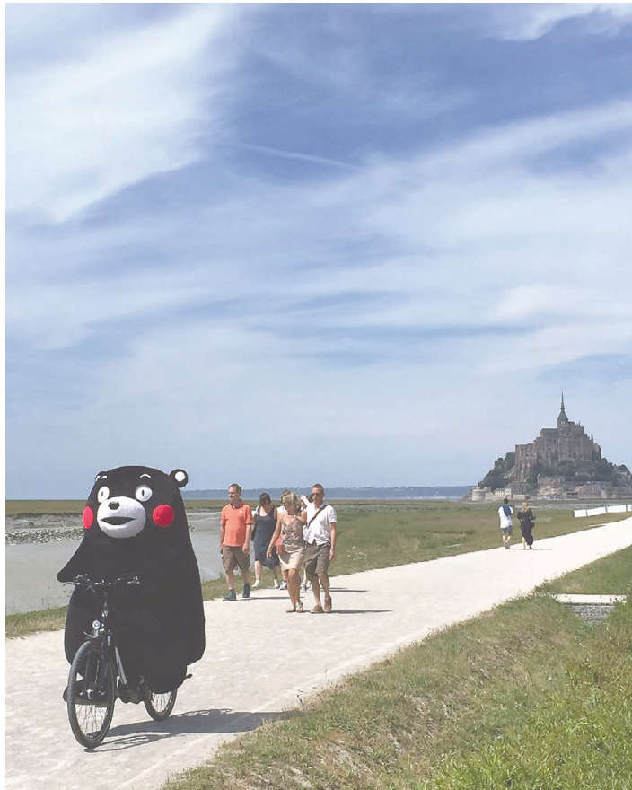
Kumamon, the official black bear mascot of Kumamoto Prefecture, rides a bicycle near Mont Saint-Michel in Normandy on July 4. The popular Japanese character was designated as a sightseeing and goodwill ambassador to France for fiscal 2017.

2018 will be a great year for the Franco-Japanese relationship and friendship. We will celebrate the 160th anniversary of the establishment of our diplomatic ties and "Japonismes," an exceptional display of Japanese arts and traditions in France, is under preparation. All this will pave the way for an even closer partnership between our countries, as well as one that is more intense, ambitious and forward looking. I wish you all a very happy 14th of July!