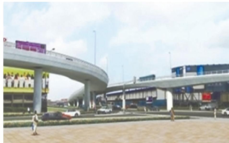
Model of the Japan-Côte d'Ivoire Friendship Interchange, which is under construction in Abidjan EMBASSY OF CÔTE D'IVOIRE

Congratulations to the People of the Republic of Côte d'Ivoire on the 57th Anniversary of Their Independence