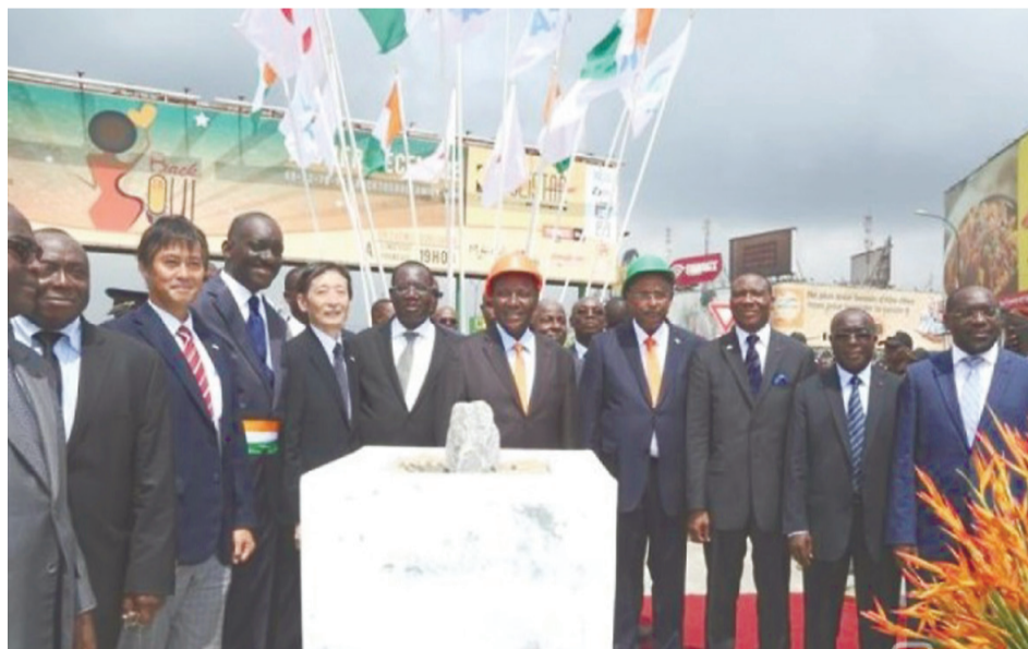
Groundbreaking ceremony for the Japan-Côte d'Ivoire Friendship Interchange, attended by the Vice President of Côte d'Ivoire and the Ambassador of Japan to Côte d'Ivoire

To conclude, I express my sincere thanks to The Japan Times for its efforts to make this publication possible and to allow me to present my country to its readers. I finally convey my sincere gratitude to the companies such as Group CEMOI, Marubeni Corp., Mitsubishi Corp. and Ajinomoto Co. for their continuous support to the embassy and also their generosity in sponsoring this message.