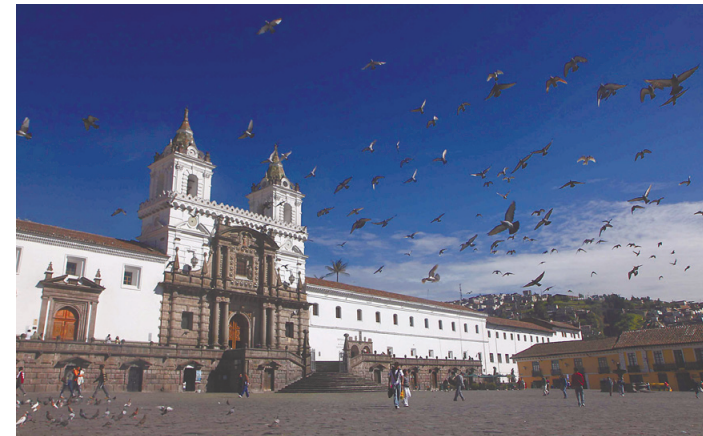
Plaza de San Francisco in Quito

In 2018, Ecuador and Japan will commemorate 100 years of the establishment of diplomatic relations. This remembrance is a great occasion to strengthen the friendly relationship between our countries. Furthermore, it is an important threshold