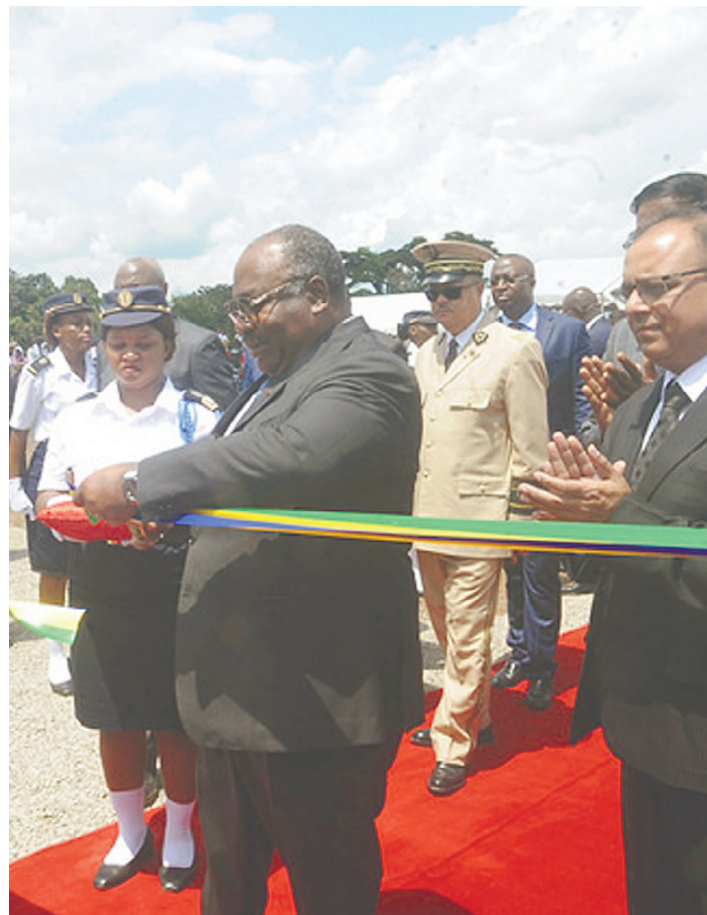
President Ali Bongo Ondimba cuts the ribbon at the opening of a Nouvelle Gabon Mining manganese plant in Biniomi on May 8.

All of this means that Gabon's economy is shifting, becoming more and more globally open — and global includes Japan. Further to the official partnership that is already excellent, I would like to reiterate the interest of the Gabonese Republic to further develop and consolidate the existing cordial relations with the Japanese business sphere in a win-win spirit.