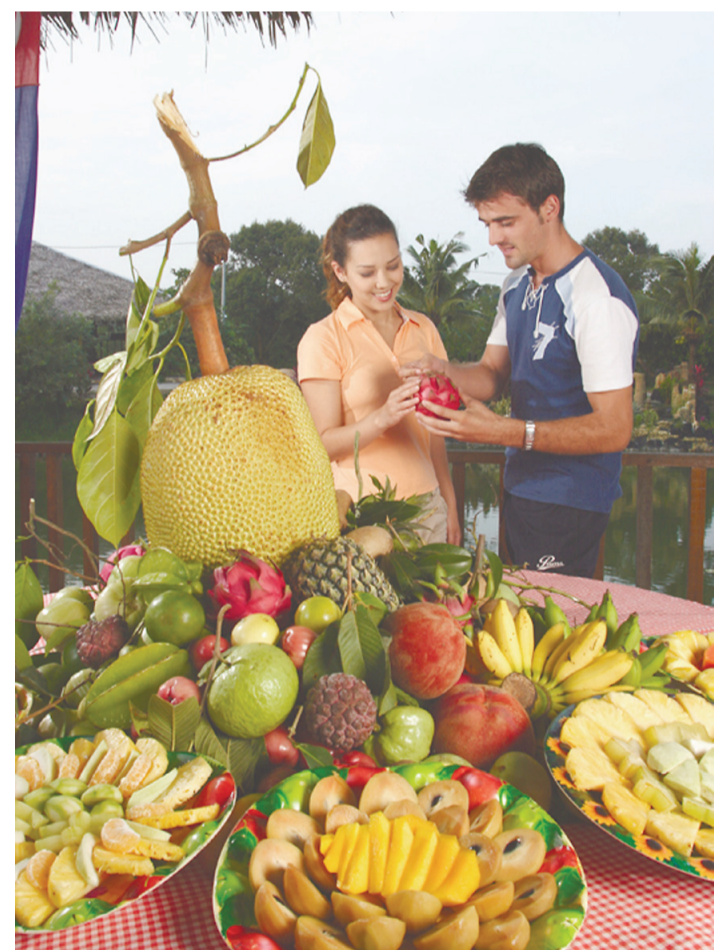
Malaysia produces a wide variety of tropical fruit.

In closing, I would like to once again offer my heartiest congratulations to Malaysia and my best wishes for its future development.