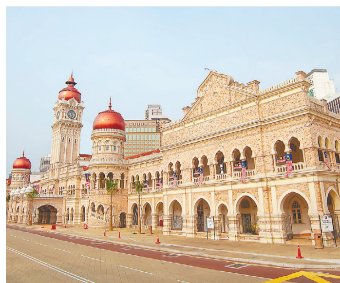
Left: The Sultan Abdul Samad Building, one of the heritage landmarks in Kuala Lumpur; Right: A spectacular sunset at Pangkor Island in the state of Perak

To all Malaysians and friends of Malaysia, happy national day 2017!