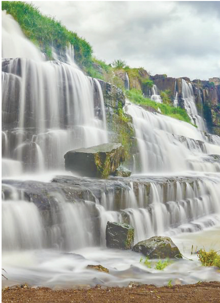
Datanla Falls just outside of Dalat

extend our sincerest gratitude to the government and people of Japan for their valuable support and cooperation over the years. I am convinced that Vietnam-Japan relations are entering a new era of development on a solid foundation and under favorable conditions. This will undoubtedly help bring about optimal results for our peoples and for peace, stability and prosperity in the region.