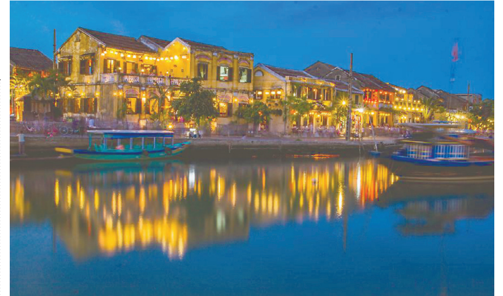
Hoi An's riverside comes alive at night.

In his concluding remarks at the Vietnam Investment Forum in Tokyo last June, the Japanese Prime Minister said: "Japan will work with Vietnam to enhance collaboration across the entire spectrum of both markets in Vietnam and Japan under a broad strate-