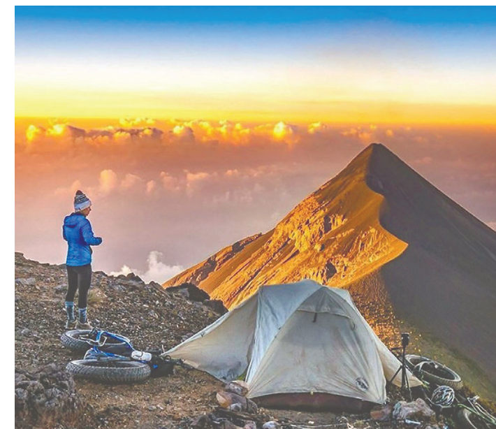
Guatemala's valleys, mountains and forests offer perfect places and natural attractions for outdoor activities such as hiking or trekking, providing a chance to see incredible scenery.