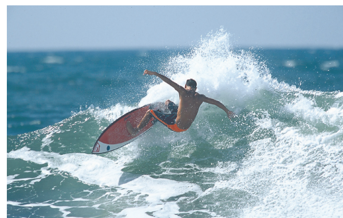
The beaches of El Salvador: paradise for avid surfers, with enough waves for everyone. Tourists can also enjoy the Salvadoran cuisine and hospitality.