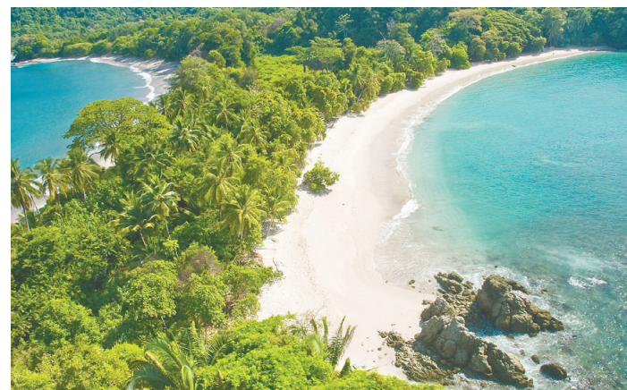
Manuel Antonio Beach, located in the southwest of Costa Rica, consists of three adjacent white sand beaches and is the most visited due to its scenic beauty.