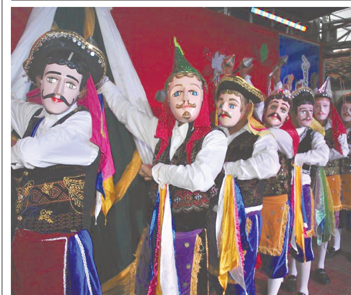
El Gueguense is a satirical drama and was the first literary work of post-Columbian Nicaragua. It is regarded as one of Latin America's most distinctive colonial-era expressions and is Nicaragua's signature folklore. NICARAGUA