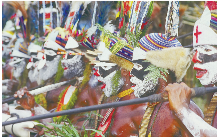
Papua New Guinea boasts diverse and unique cultures with over 1,000 different ethnic tribes.

Finally, I extend my most sincere appreciation and gratitude to The Japan Times and our sponsors on these pages.