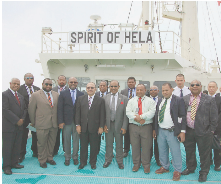
Papua New Guinea's Prime Minister Peter O'Neill (sixth from left) celebrates the arrival of the LNG vessel carrying the first cargo from the PNG liquefied natural gas project in Futtsu, Chiba Prefecture, in June 2014.