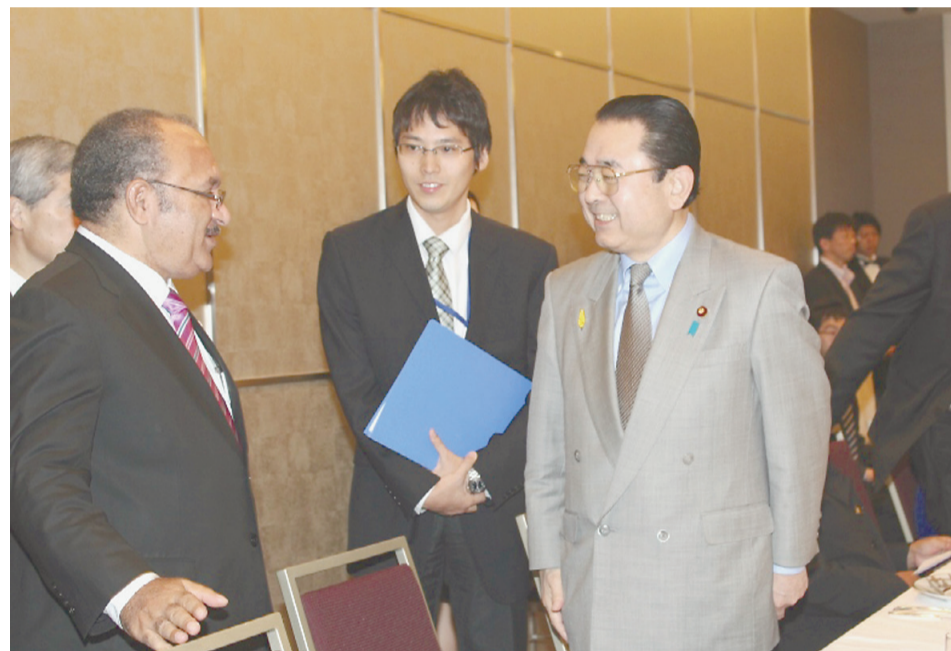
The close bilateral relations have seen a number of high-level visits in recent years.

Congratulations to the People of Papua New Guinea on the 42nd Anniversary of Their Independence