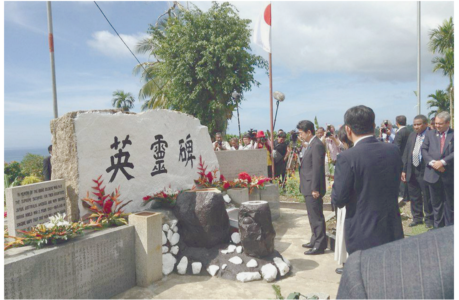
Prime Minister Shinzo Abe pays tribute to World War II dead in Wewak during his visit to Papua New Guinea in July 2014.

new government has also undertaken to deliver key reforms to strengthen our systems and processes of service delivery and accountability. These include more autonomy for provinces and districts, electoral reforms, good governance, telecommunication, climate change, gender equality and women empowerment.