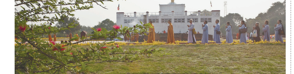
Lumbini, the birthplace of Lord Buddha EMBASSY OF NEPAL