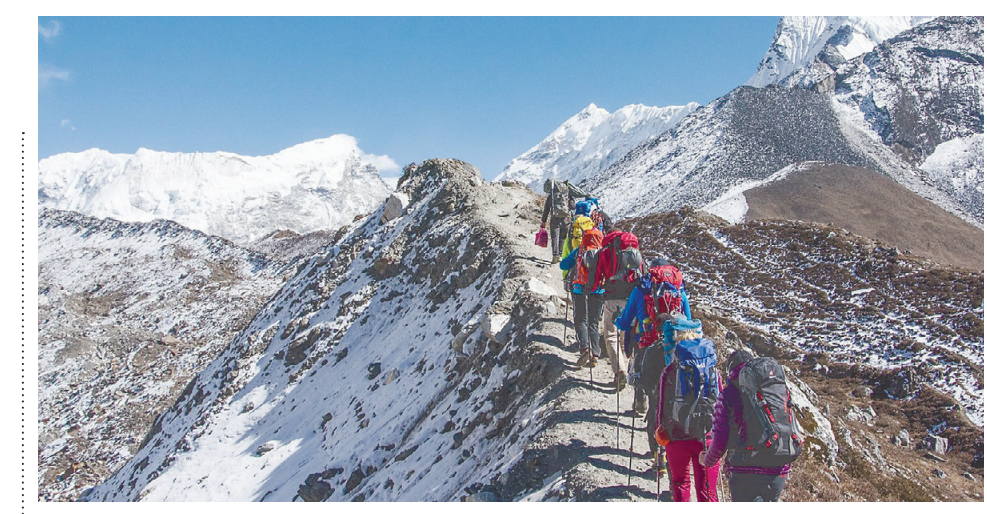
Nepal is famous for trekking. EMBASSY OF NEPAL

It has been just a few months since assuming my duty as ambassador to Japan. As the first female ambassador of Nepal to Japan,