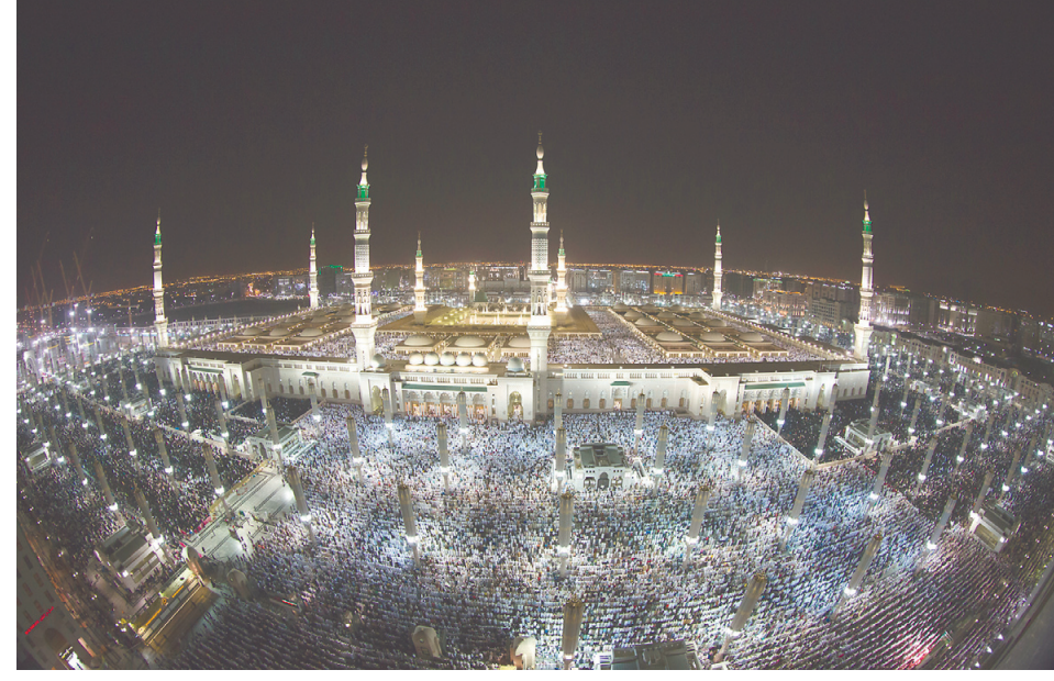
Medina. the second-holiest site in Islam EMBASSY OF SAUDI ARABIA

Anyone reading about the economies of the Kingdom of Saudi Arabia and Japan, both countries' potentials and the status of