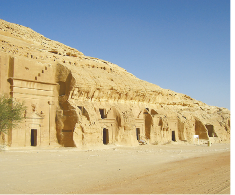
Clockwise from above: Al-Masjid al-Haram in Mecca; Masmak Fort in Riyadh and Mada'in Saleh, a UNESCO World Heritage site