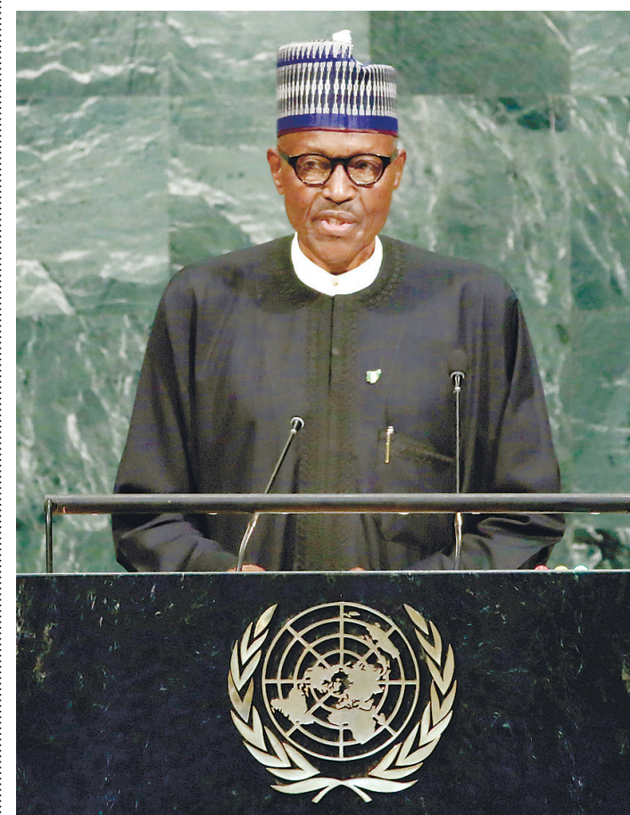
President Muhammadu Buhari addresses the 72nd session of the U.N. General Assembly on Sept. 19.

Long live the Federal Republic of Nigeria! Long live Japan!