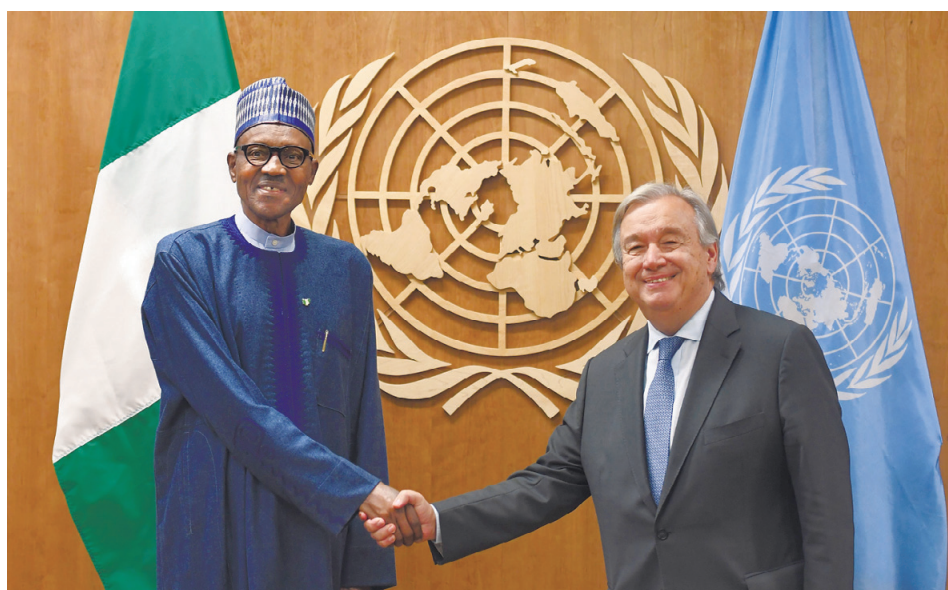
President Muhammadu Buhari meets U.N. Secretary-General Antonio Guterres at U.N. headquarters on Sept. 20.

Nigerians renewed optimism in its new phase of nation-building. Amid daunting challenges, the present administration led by our president has set the country on the path of progress, especially on three key areas of diversification of the economy, security and the fight against corruption.