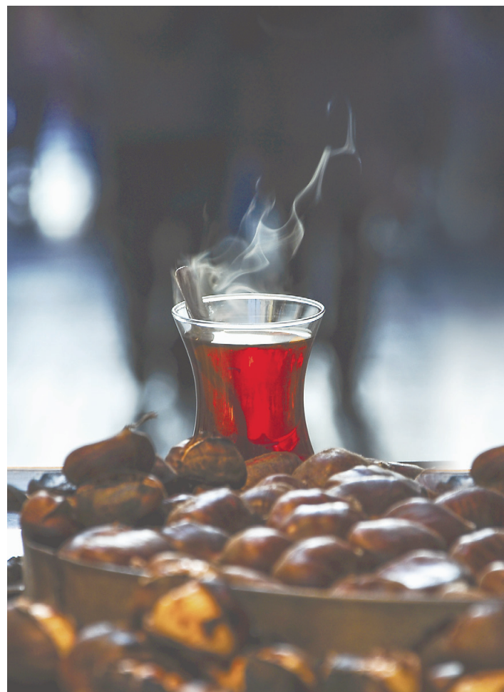
Renowned Turkish tea EMBASSY OF TURKEY

With these thoughts in mind, I would like to extend, once again to the readers of The Japan Times, our most heartfelt greetings.