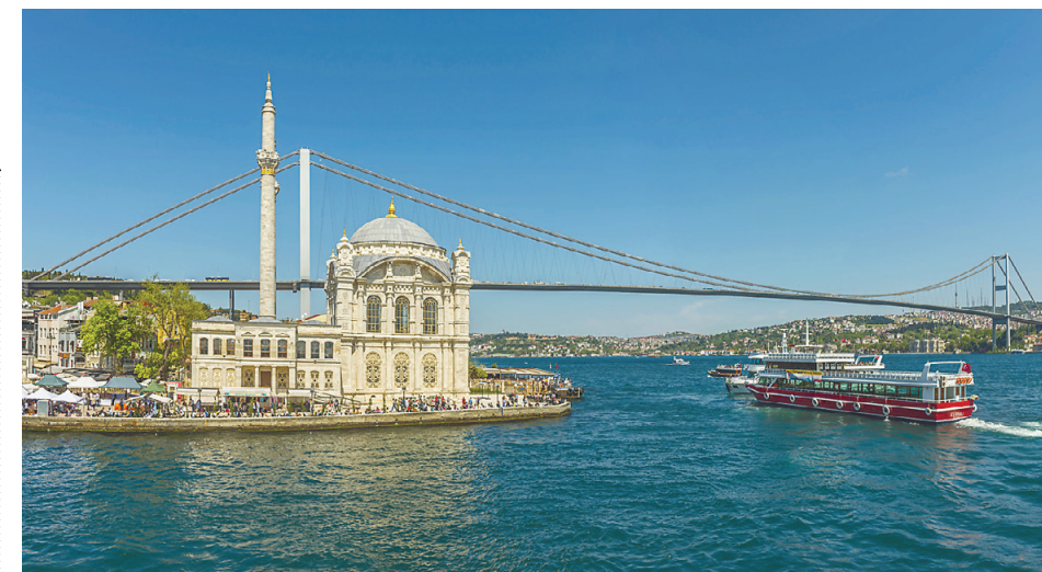
Istanbul offers a blend of traditional and modern elements. EMBASSY OF TURKEY

Turkey is one of the leading tourism destinations in the world. With its rich historical legacy, beautiful coastline, stunning scenery, exquisite cuisine, exciting events and cultural festivals, it attracts millions of tourists from all over the world. Turkey offers a captivating blend of antiquity and contemporary and of East and West in all aspects. Turkish cuisine is essentially the continuation of the Ottoman cuisine, which in turn made an excellent