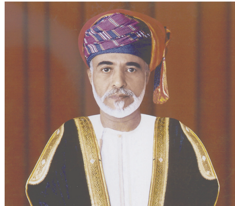
His Majesty Sultan Qaboos bin Said

I would also like to express our appreciation to the government and people of