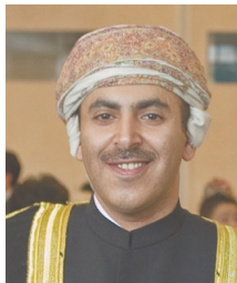
KHALID AL-MUSLAHI AMBASSADOR OF THE SULTANATE OF OMAN

The Sultanate of Oman commemorates its 47th National Day on Nov. 18, and the people of Oman celebrate this significant occasion in the nation's modern history