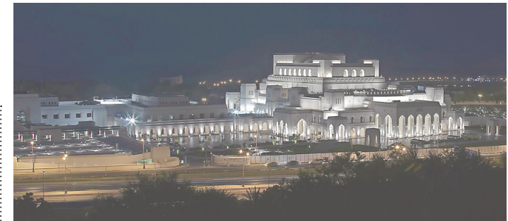
The Royal Opera House is a center of world-class performances and worth a visit for its splendid architecture alone.

The achievements made would not have been possible without constructive planning, wise leadership, full dedication and strenuous efforts for the progress of Oman and on ensuring equality among all Omanis and on upholding the rule of law. The strides for more progress continue on in various fields to make Oman, as it has always been, an oasis for peace and prosperity and one of the most attractive places in the world for business and tourism.