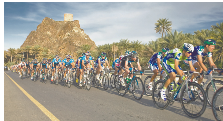
The Tour of Oman is an annual professional bicycle race that runs through Oman's diverse landscape.

In closing, I would like to express my heartfelt appreciation and gratitude to the people of Japan for their kindness and hospitality, and to our many friends in Japan for their support and assistance in promoting the good relations between our two friendly peoples. I am also indebted to our sponsors, whose generosity has made this supplement possible. I am confident that our relations in the coming days will see the further enhancement of close bonds of friendship between Oman and Japan.