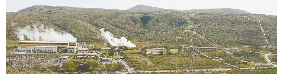
The 140-MW Olkaria V Geothermal Power Plant in Naivasha is expected to be operational by 2019.

ident was sworn into office on Nov. 28. As we celebrate this independence anniversary, I wish to reflect on the warm and cordial relationship that exists between our two friendly countries that has continued to grow from strength to strength over the last