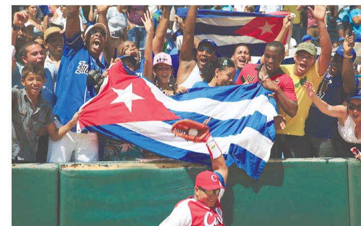
Left: Cayo Guillermo has beautiful beaches and crystal clear waters; Above: baseball is Cuba's national sport.