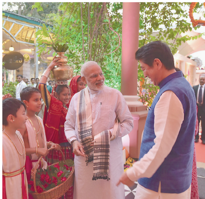
Top: Prime Minister Shinzo Abe and Prime Minister Narendra Modi shake hands at the 12th India-Japan summit in Gandhinagar, the capital of the western state of Gujarat on Sept. 14. Bottom: The prime ministers en route from the airport in Ahmedabad, Gujarat, to the city on Sept. 15.