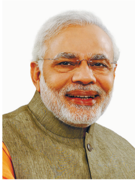
Prime Minister of India H.E. Narendra Modi

Over the past three years, the government of India has taken several initiatives to promote economic growth and improve investor confidence and business senti-