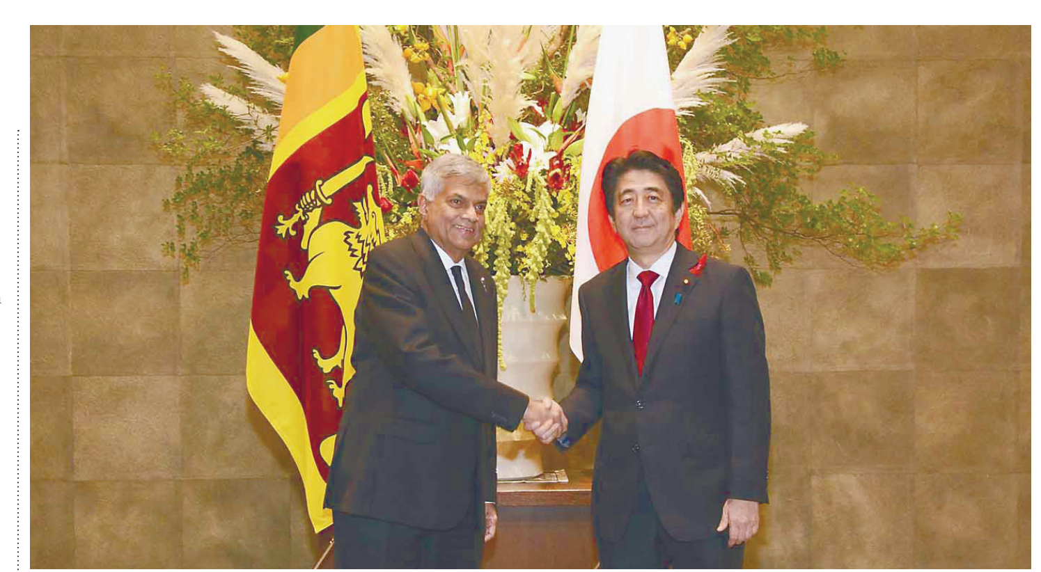
Sri Lankan Prime Minister Ranil Wickremesinghe and Prime Minister Shinzo Abe shake hands in Tokyo on April 12.

As we celebrate this occasion, the government and people of Sri Lanka look forward to strengthening the bonds of friendship and cooperation with the government and people of Japan on the basis of our shared values, our commitment for democracy and international peace and