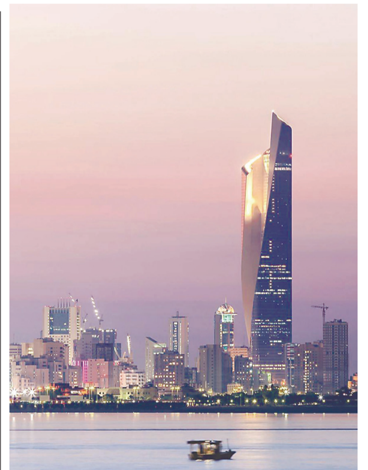
Kuwait City skyline EMBASSY OF KUWAIT