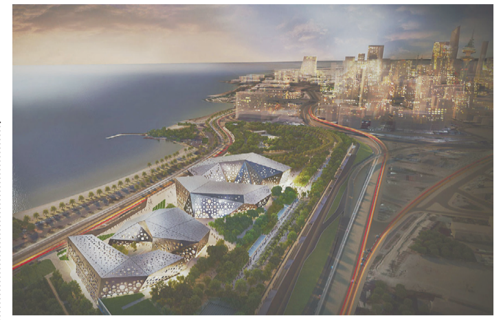
The Sheikh Jaber Al-Ahmad Cultural Centre is a landmark in Kuwait City. EMBASSY OF KUWAIT

Independence also marked the outset of Kuwait's relations with Japan, which was among the first countries to recognize Kuwait's independence, even though bilateral trade started before the establishment of diplomatic relations. Today, we have a comprehensive multilevel partnership spanning many areas, including the oil industry, infrastructure, technical training, scientific research and people-to-people exchanges. Bilateral trade has been ever-increasing and