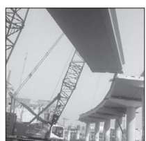
METRO LINE PROJECT