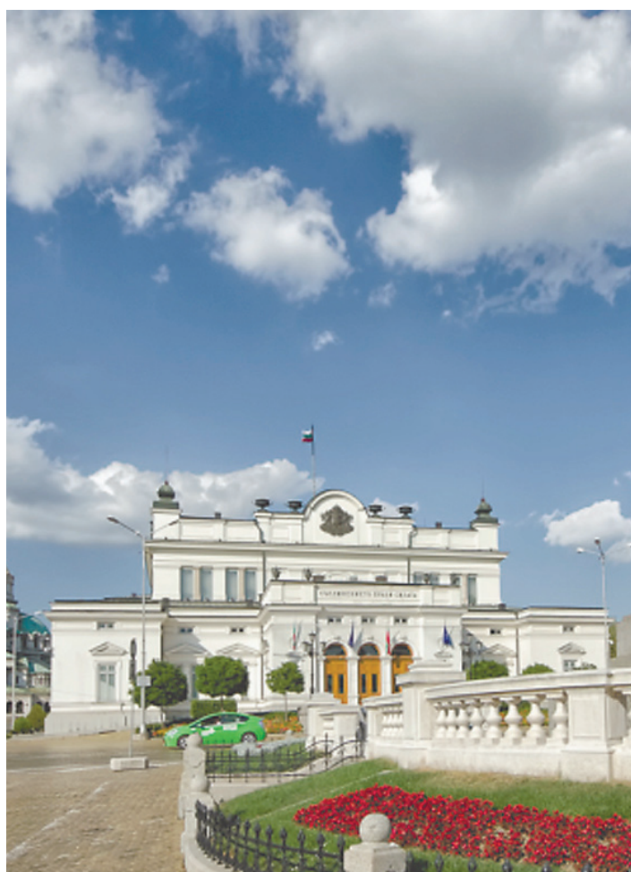
The National Assembly in Sofia. EMBASSY OF BULGARIA