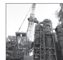
DG CEMENT PLANT HUB