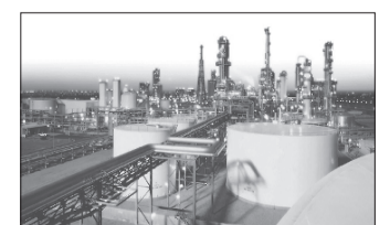
OIL REFINERY KARACHI