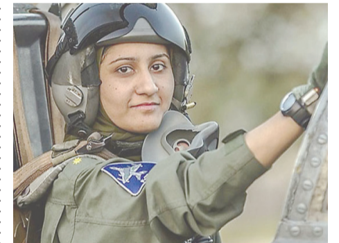
Ayesha Farooq, first female fighter pilot of the Pakistan Air Force.