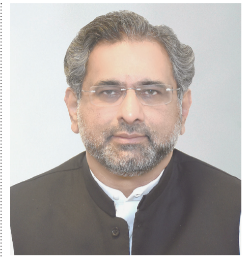
Prime Minister of Pakistan Shahid Khaqan Abbasi

energy and investor enthusiasm regarding available and emerging opportunities in Pakistan. The Japan External Trade Organization's (JETRO) 2018 survey, released this month, rated Pakistan as the top destination for Japanese companies for expected profits, plans for expansion of operations and hiring of local labor force. Similar assessments by Forbes, Bloomberg and Nikkei respectively on Pakistan being "Asia's next growth engine," "global turnaround story" and best undiscovered frontier market clearly highlights Pakistan's potential as an emerging market. The nation offers tremendous new opportunities that Japanese investors are in ideal positions to benefit from. In this regard, the Pakistan embassy in Tokyo, in collaboration with JETRO and The Bank of Tokyo-Mitsubishi UFJ, has also launched an investment seminar series across Japan to apprise the Japanese business community of the investment opportunities available in Pakistan. The response to the series has been remarkable and several Japanese enterprises have already traveled to Pakistan, while several other organizations are actively exploring investment