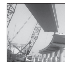
ORANGE LINE LAHORE