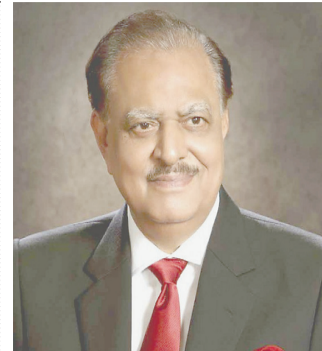
President of Pakistan Mamnoon Hussain