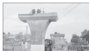
KPK METRO PROJECT

YCA ENGINEERING COMPANY (PVT) LTD., LAHORE, PAKISTAN TEL: +92-42-35714020/21 FAX: +92-42-35714119 EMAIL: ycaengineeringno1@gmail.com