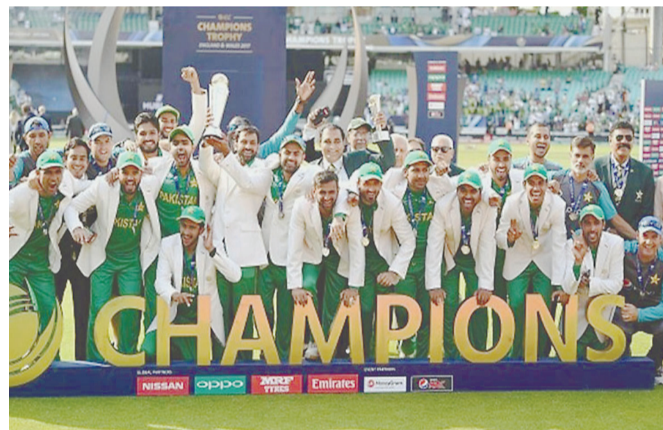
Top: The Katas Raj Temples in Punjab are among the country's oldest Hindu temples. Bottom: Pakistan won the ICC (International Cricket Council) Champions Trophy for the first time in 2017.

I would like to take this opportunity to extend my best wishes for the continued prosperity of Pakistan and further development of friendly relations between Japan and Pakistan.