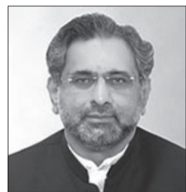
Prime Minister of Pakistan Shahid Khaqan Abbasi