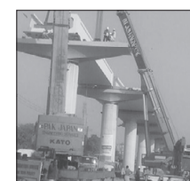
ORANGE LINE LAHORE