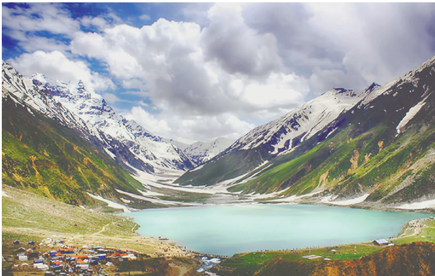
Kaghan's Lake Saiful Muluk in northern Pakistan. The lake has one of the highest elevations of Pakistan's alpine lakes.

Our Warmest Congratulations to the State and the People of the Islamic Republic of Pakistan on the 78th Anniversary of Their National Day