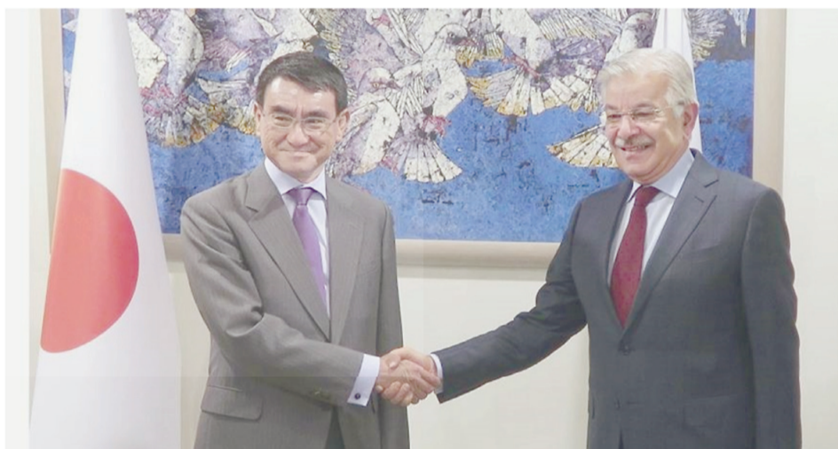
Foreign Minister Taro Kono and Pakistani Foreign Minister Khawaja Muhammad Asif shake hands at a meeting in Islamabad on Jan. 4.

Long live Pakistan and long live the Pakistan-Japan friendship.