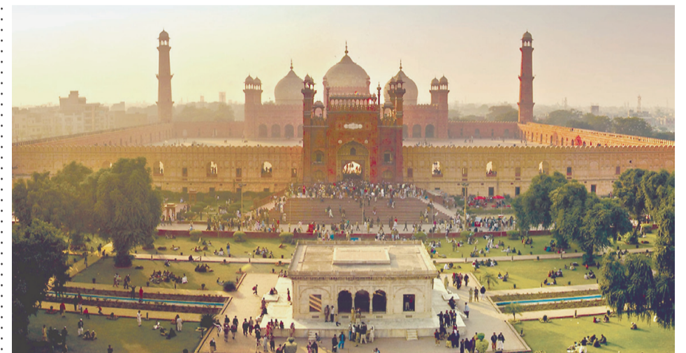
Badshahi Mosque is located in Lahore, the capital of the Punjab province. The mosque is one of the largest in the world and was completed in 1673 under Emperor Aurangzeb of the Mughal Empire.