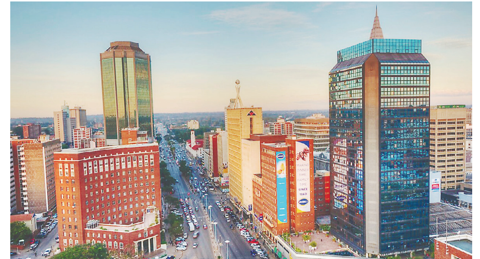
Samora Machel Avenue, a main street that runs through the center of Harare. EMBASSY OF THE REPUBLIC OF ZIMBABWE

This content was compiled in collaboration with the embassy. The views expressed here do not necessarily reflect those of the newspaper.