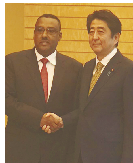
Deputy Prime Minister Demeke Mekonnen shakes hands with Prime Minister Shinzo Abe on June 12, 2017.