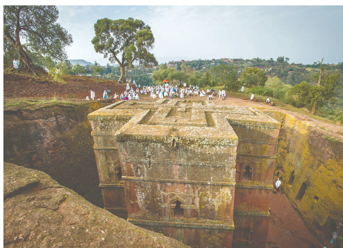
Rock-hewn churches of Lalibela. EMBASSY OF ETHIOPIA

Congratulations to the People of the Federal Democratic Republic of Ethiopia on the 27th Anniversary of Their National Day