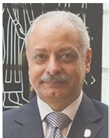
AYMAN ALY KAMEL AMBASSADOR OF EGYPT

Today, we celebrate the National Day of Egypt, commemorating the occasion of the 66th anniversary of the July 23, 1952, revolution. It is an iconic day in Egyptian modern history that enabled