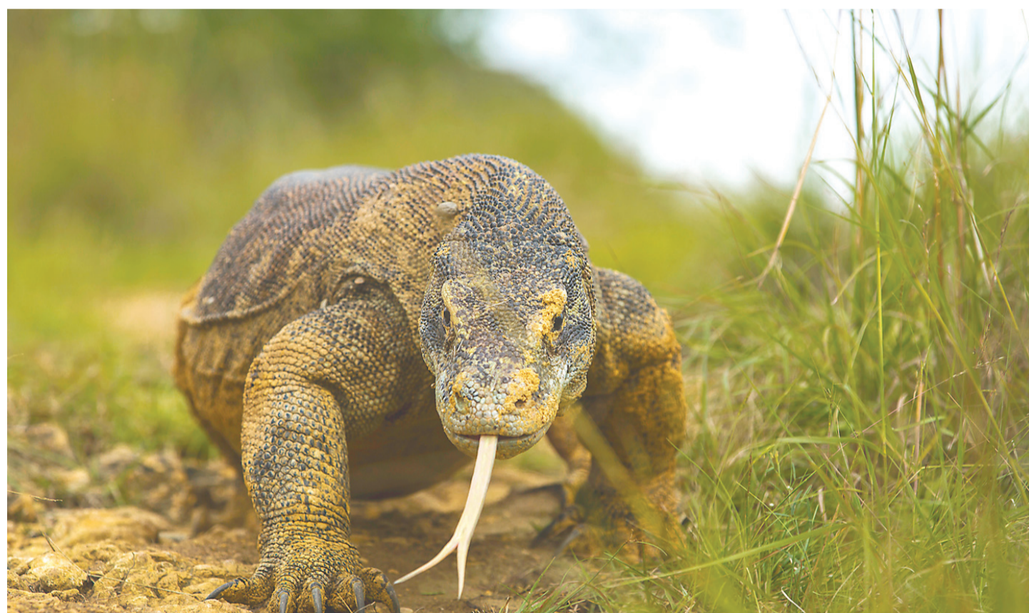
Indonesia boasts rich biodiversity that includes Komodo dragons. These lizards can grow to be a maximum of three meters long and are only found on Komodo Island and several other Indonesian islands.

Selamat Hari Kemerdekaan Republik Indonesia yang ke-73! Congratulations on the 73rd anniversary of the independence of Indonesia.