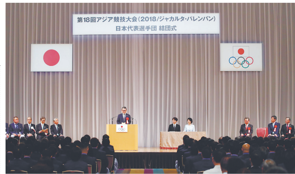
Indonesian Ambassador Arifin Tasrif speaks in Tokyo at an Aug. 13 ceremony for Japanese athletes ahead of the 2018 Asian Games that kick off in Indonesia on Aug. 18.

with Africa, South and Central Asia, as well as Latin America. As an embodiment of Indonesia's commitment to strengthening economic engagement with African countries, Indonesia initiated the first Indone-