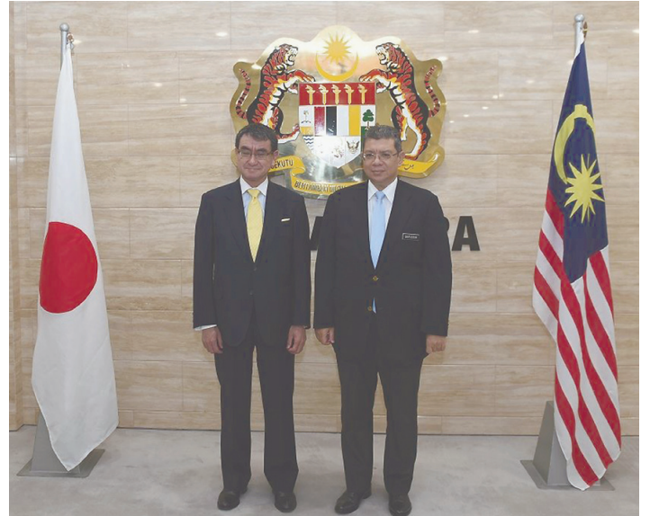
Japanese Foreign Minister Taro Kono and Malaysian Foreign Minister Dato' Saifuddin Abdullah in Putrajaya, Malaysia, on July 11.