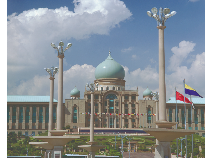
Putrajaya will host the 61st National Day anniversary celebration under the theme "Sayangi Malaysiaku" (Love My Malaysia).