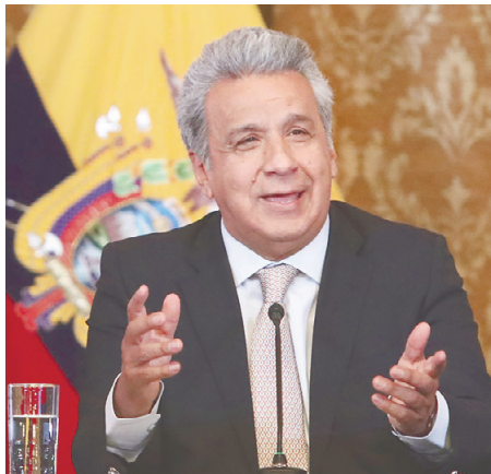
President Lenin Moreno Garces

business meeting organized with the Japan Business Federation, Keidanren, and will hold a reception to commemorate the 100th anniversary of the establishment of diplomatic relations.