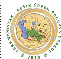
Emblem celebrating the independence of Turkmenistan.

Today, Turkmen-Japanese cooperation is successfully developing in different fields. Our country's enterprises work in cooperation with dozens of major Japanese corporations implementing large regional projects, especially in the oil and gas fields. The Japanese business community not only knows Turkmenistan as a country that possesses the world's fourth-largest reserves of natural gas, but also as a politically, socially and financially stable, strong and loyal partner. Taking into account bilateral relations based on the principles of mutual trust, mutual benefits and regional cooperation, the Turkmen-Japanese business forum was held on July 2,