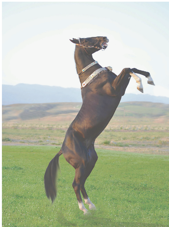
The Akhal-Teke, a horse breed native to Turkmenistan, is a symbol of power in the country.

This content was compiled in collaboration with the embassy. The views expressed here do not necessarily reflect those of the newspaper.