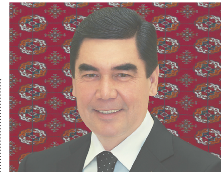
President Gurbanguly Berdimuhamedov

Another strategic direction of the foreign policy of Turkmenistan is to establish productive relations with Asia-Pacific countries. Therefore, Japan, which is the only Group of Seven country in the region, is one of the most important partners of Turkmenistan. As the ambassador of Turkmenistan in Japan, my main duty is to implement agreements reached during the visits of President Gurbanguly Berdimuhamedov to Japan in 2013 and