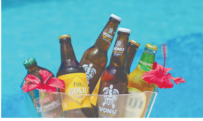
Top: Prime Minister Josaia V. Bainimarama and Prime Minister Shinzo Abe attend a news conference after their meeting at the Prime Minister's Office in Tokyo on May 16. Above: A variety of Fijian beers are enioved by local residents and tourists.