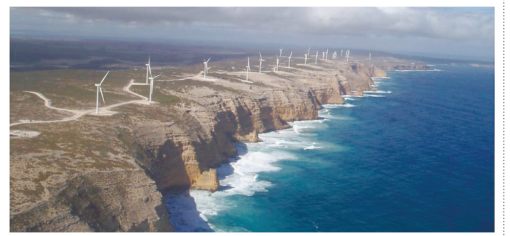
Spain is the world's fifth-largest producer of wind power. MARCA ESPANA

To mark this occasion, we have presented a program of more than 50 cultural and institutional events in Tokyo and 15 other cities in Japan. The Prado Museum exhibition in Tokyo and Kobe, artistic per-