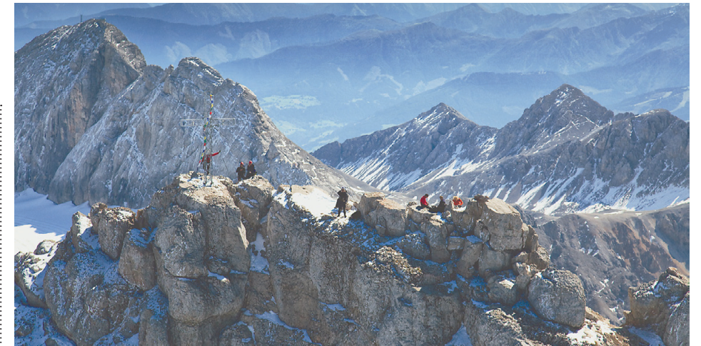
Dachstein Mountains in the Northern Limestone Alps.

This content was compiled in collaboration with the embassy. The views expressed here do not necessarily reflect those of the newspaper.