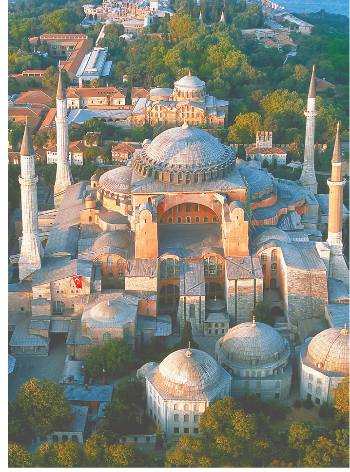
The historic Hagia Sophia Museum in Istanbul.

In concluding my remarks, I would like to extend our sincere thanks and appreciation to the government of Japan, the Japan-Turkey Friendship Society, the Tokyo Japanese-