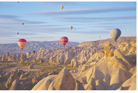
Region of Cappadocia. EMBASSY OF TURKEY

c/o ITOCHU Building 5-1, Kita-Aoyama 2-chome, Minato-ku, Tokyo 107-0061