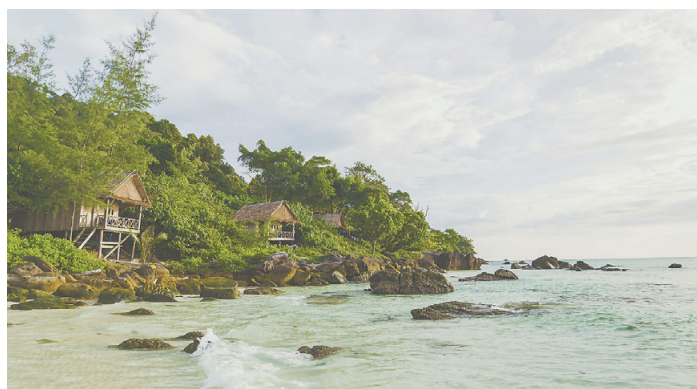
The island of Koh Rong in Sihanoukville province.

Finally, I cordially extend my heartfelt wishes of happiness and further prosperity to the Kingdom of Cambodia.