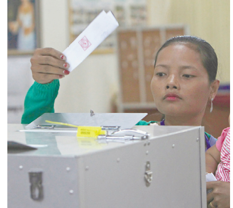
A woman casts her ballot for the senate election at a polling station in Kandal province, southeast of Phnom Penh, in February.

Kingdom of Cambodia, as well as for the happiness of its people. I also look forward to witnessing the cordial friendship between Cambodia and Japan continue to grow in the years to come.