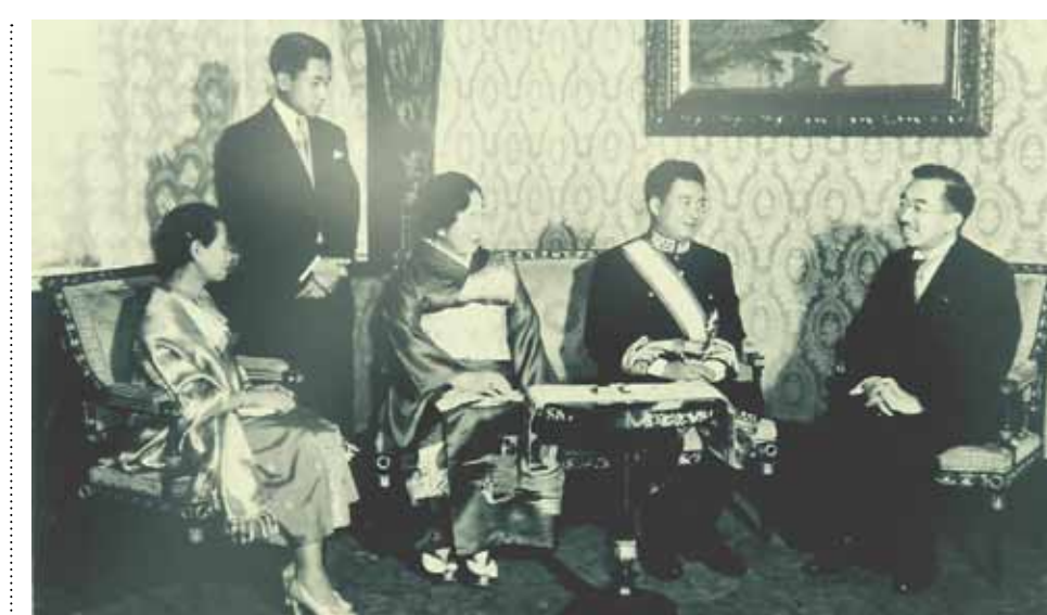
Prince Norodom Sihanouk (second from right) meets Emperor Hirohito (right), Empress Nagako (third from right) and then-Crown Prince Akihito during his visit to Japan in December 1955.

The government of Japan has enormously contributed not only to the Cambodian peace process but also to the post-conflict reconstruction and economic development of Cambodia. Its invaluable support has