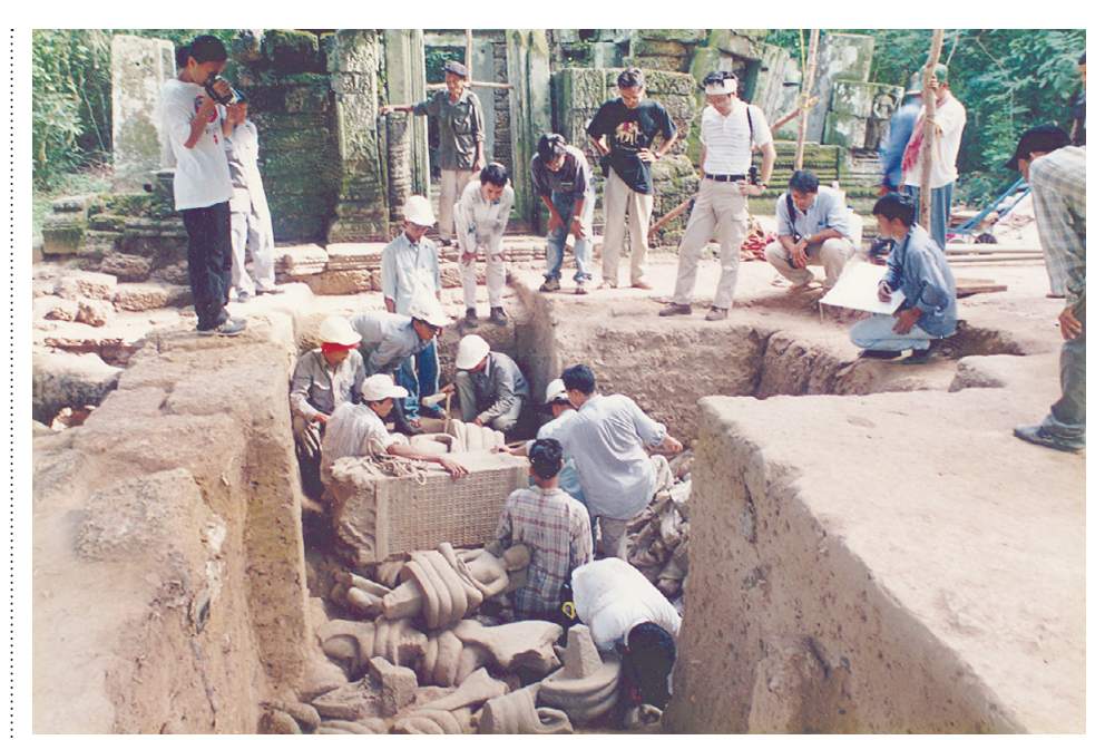
274 Buddha statues were discovered at Banteay Kdei, Angkor, in 2001 during Sophia University's excavation training with students from the Royal University of Fine Arts in Phnom Penh.

In 1979, we launched a campaign extending hands of love to refugees from Indochina, in Tokyo, and thereby commenced the relief of refugees, and at the same time, in the thick of the battle, we entered Cambodia, and appealed to the entire world to come forward and rescue the nation's monuments. We sent out an SOS on behalf of Angkor, but since the Heng Samrin administration was labeled a