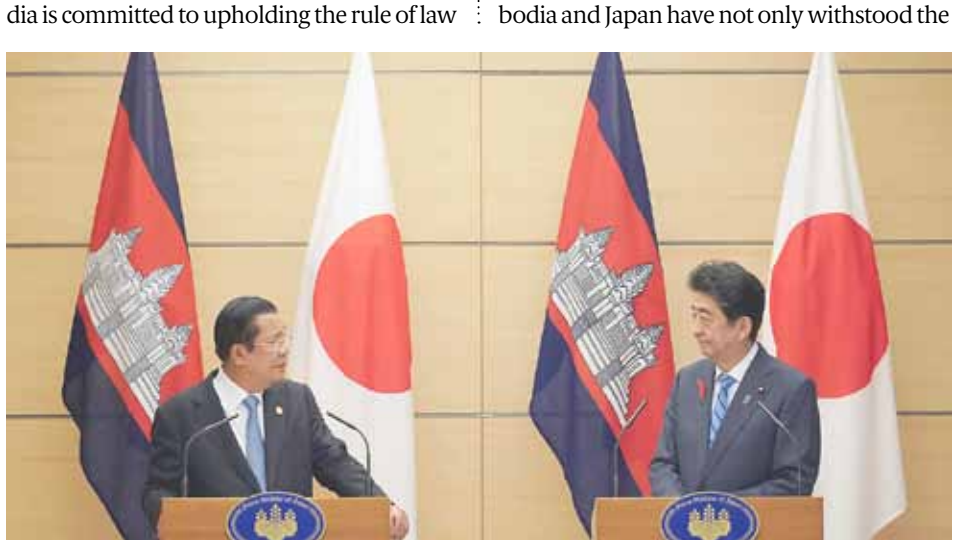
Prime Minister Hun Sen and Prime Minister Shinzo Abe attend a joint news conference at the Prime Minister's Office in Tokyo on Oct. 8.

During the course of these 65 years, Cambodia and Japan have not only withstood the