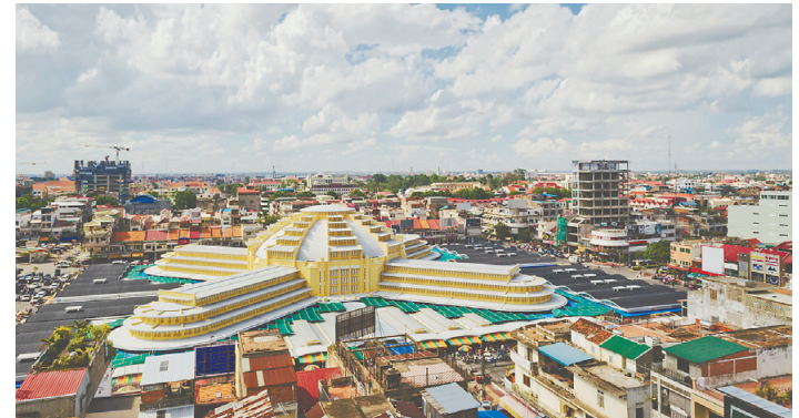
The Central Market is a landmark in Phnom Penh.