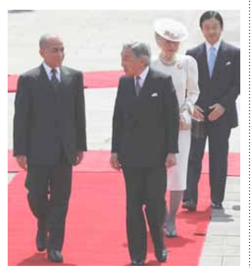
His Majesty King Norodom Sihamoni and Emperor Akihito at the Imperial Palace in Tokyo in May 2010.

From 1953, Cambodia has been through various political systems and the country's