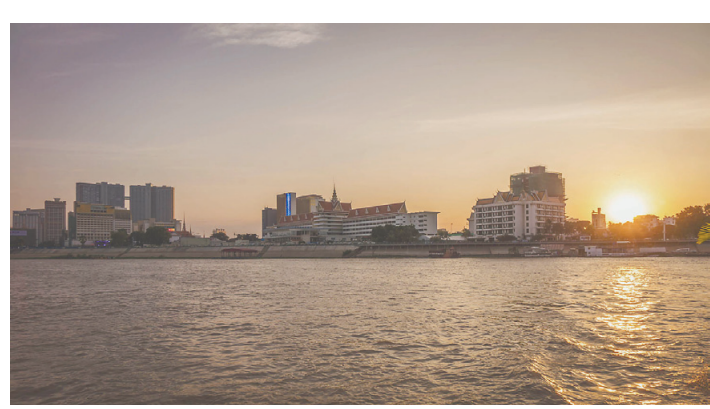
\textbf{The city of Phnom Penh along the Tonle Sap River.}