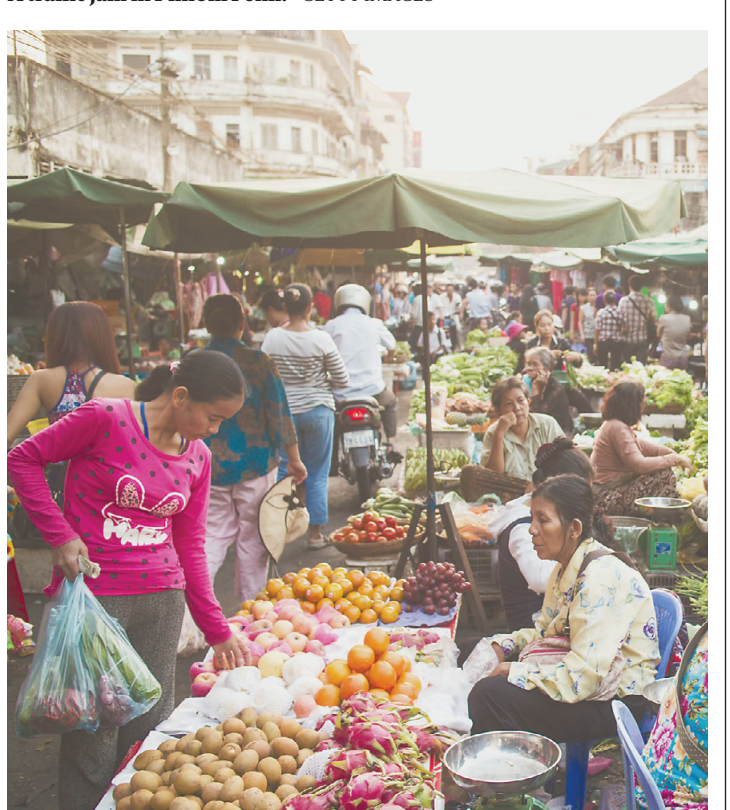
A traditional market in Phnom Penh.

Cambodian Yazaki Energy System Co., Ltd. Yazaki (Cambodia) Products Co., Ltd.