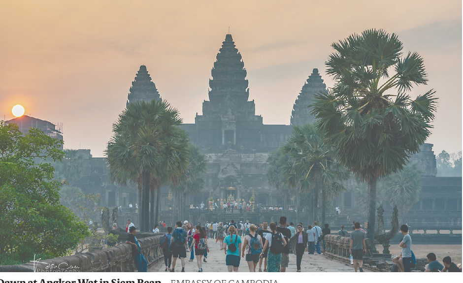
Dawn at Angkor Wat in Siem Reap.

courage and vigor, in 1996 we began restoration work on the Western Causeway of Angkor Wat. In order for the footsteps of peace to be heard by all, we sent out pleas to the entire world, along with young Cambodian conservators. The posture we adopt is that the restoration of the monuments of Cambodia should be done by the Cambodians, for the Cambodians. To allow such restoration work on Angkor Wat to be carried out by the Cambodian people themselves, we have trained conservators and stone masons at the site of the Angkor ruins since 1991. I was able to help some Cambodian conservators undergo training at the graduate school of Sophia University as foreign students, and among them, 19 have secured graduate degrees, with eight receiving doctorates and 11 receiving master's degrees. Also, since 2016, we have, with the guidance of these young Cambodian conservators, started the second phase of restoration work on the Western Causeway of Angkor