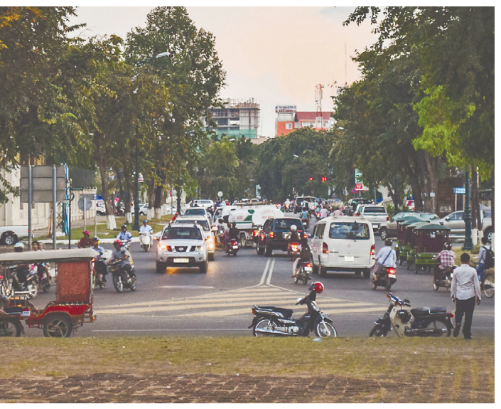
A traffic jam in Phnom Penh.