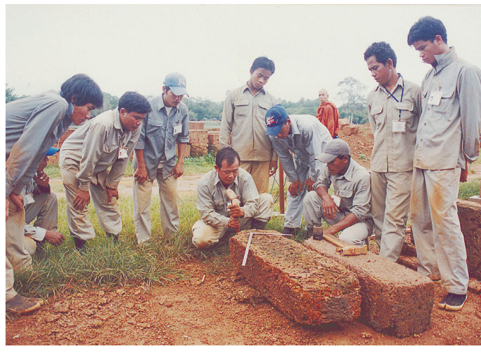
Cambodian stone masons, who were trained by the Sophia University Angkor International Mission, restore the Western Causeway of Angkor Wat in 1996.

Wat. This international cultural contribution is a joint project linking Cambodia and Japan, a bond that will strengthen links between our two nations.