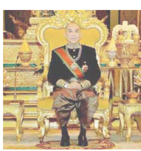
His Majesty King Norodom Sihamoni

test of time and changes in the international and regional landscapes, but also observed growing and deepening trends. The two countries have enjoyed warm relations and expanded cooperation. Given the growing significance in bilateral relations, our multidimensional cooperation was elevated to a strategic partnership in December 2013.