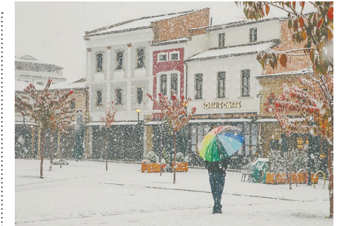
Korca, a city in southeastern Albania, covered in snow.

In conclusion, I would very much like to thank The Japan Times for honoring me today by being present for this 106th anniversary of Albania's Independence Day and helping to build the cultural bridge that can overcome the geographical distance between the two countries.