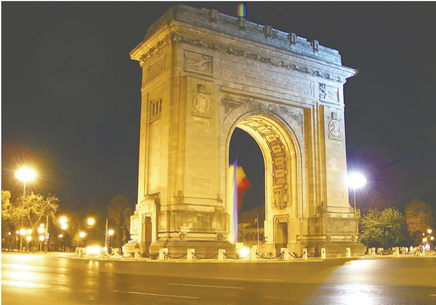
The Arch of Triumph in Bucharest was built in 1921-22 and re-built in 1936. The arch is seen as a monument to Romania's victory in World War I. Every Dec. 1, the military parades beneath the arch. EMBASSY OF ROMANIA