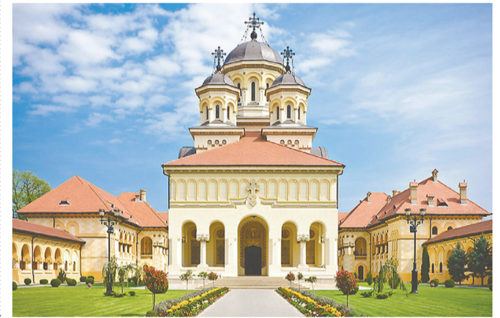
The Coronation Cathedral in the city of Alba Iulia in Transylvania, built in the later part of the 19th century. On Oct. 15, 1922, King Ferdinand and Queen Marie were crowned here as monarchs of Greater Romania.

This content was compiled in collaboration with the embassy. The views expressed here do not necessarily reflect those of the newspaper.