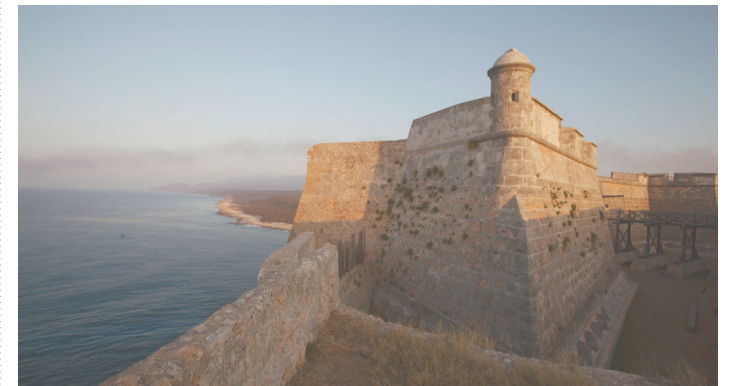
San Pedro de la Roca Castle in Santiago de Cuba was constructed in 1638. This historic, military fortress was built in response to the commercial and political rivalries that threatened the Caribbean in the 17th and 18th centuries. EMBASSY OF CUBA

This content was compiled in collaboration with the embassy. The views expressed here do not necessarily reflect those of the newspaper.