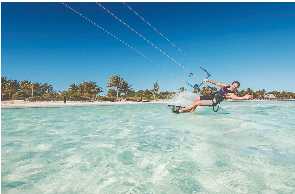
Cayo Coco, an island in central Cuba, is known for resort hotels and beautiful waters that are perfect for marine activities.

My dear friends, I renew our firm commitment to reinforce Cuba and Japan's friendship and reassurance, with pride and enthusiasm, the determination that guides our people to build a socialist, democratic, prosperous and sustainable society.