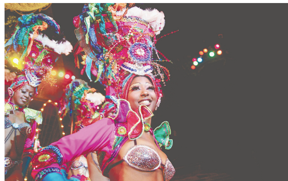
Tropicana is a famous cabaret in Havana established in 1939. The show dazzles the audience with dancing, singing and a repertoire of Cuban music played by an orchestra.