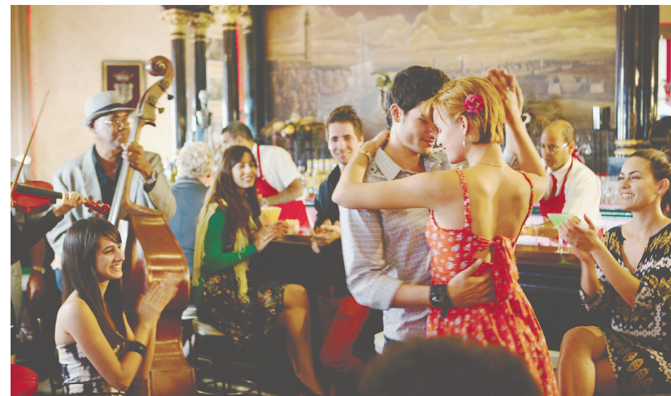
A couple dances at Floridita, a bar in Havana that is famous for daiquiris, cocktails and a sculpture of 20th-century American writer Ernest Hemingway, who was a regular customer.