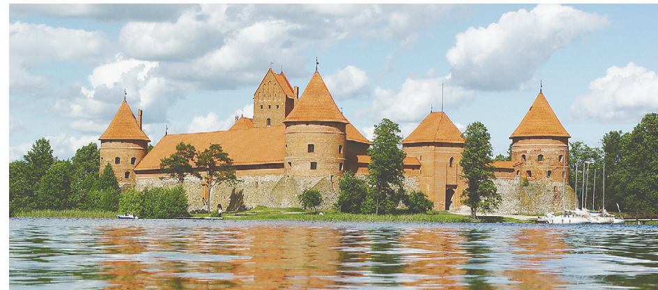
Trakai Castle, a former seat of the Grand Duchy, is now a major tourist attraction.

On this special day, I would like to express my sincere gratitude to all friends of Lithuania and wishes for the ties of friendship between our nations to flourish and grow.