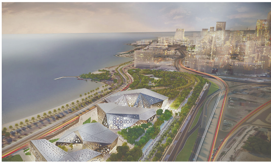
The Sheikh Jaber Al-Ahmad Cultural Centre is a multipurpose public facility.

With this in mind, I am confident that our comprehensive partnership with Japan will continue to strive in the coming years for the benefit of our respective countries and to promote peace and sustainable development around the world.