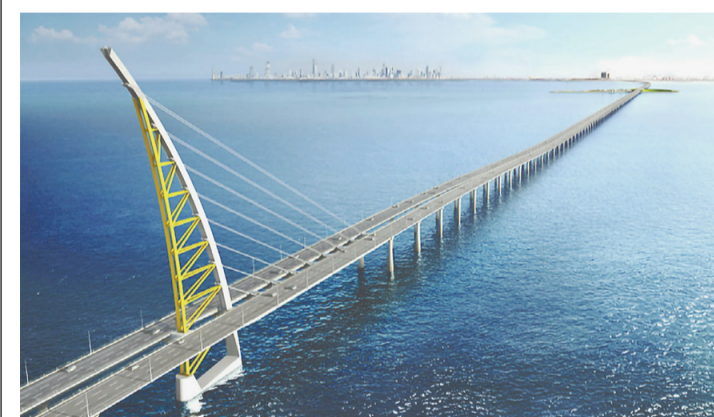
Top: Souk Sharq is a shopping mall in the city of Kuwait. Above: Sheikh Jaber Al-Ahmad Al-Sabah Causeway is a bridge that stretches across the Bay of Kuwait. EMBASSY OF KUWAIT