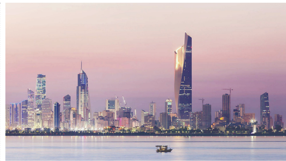
Facing the Arabian Gulf, the city of Kuwait is now a major tourist attraction.

On a bilateral level, Japan has been Kuwait's strategic partner going back to before independence, and our long-standing ties have two central pillars. One is a shared desire to further strengthen our cooperation in the political, economic, investment, environment and cultural spheres. The other is a resolute belief in human rights and a common goal of creating a world of peace, security and prosperity for all nations regardless of race, religion or ethnicity.